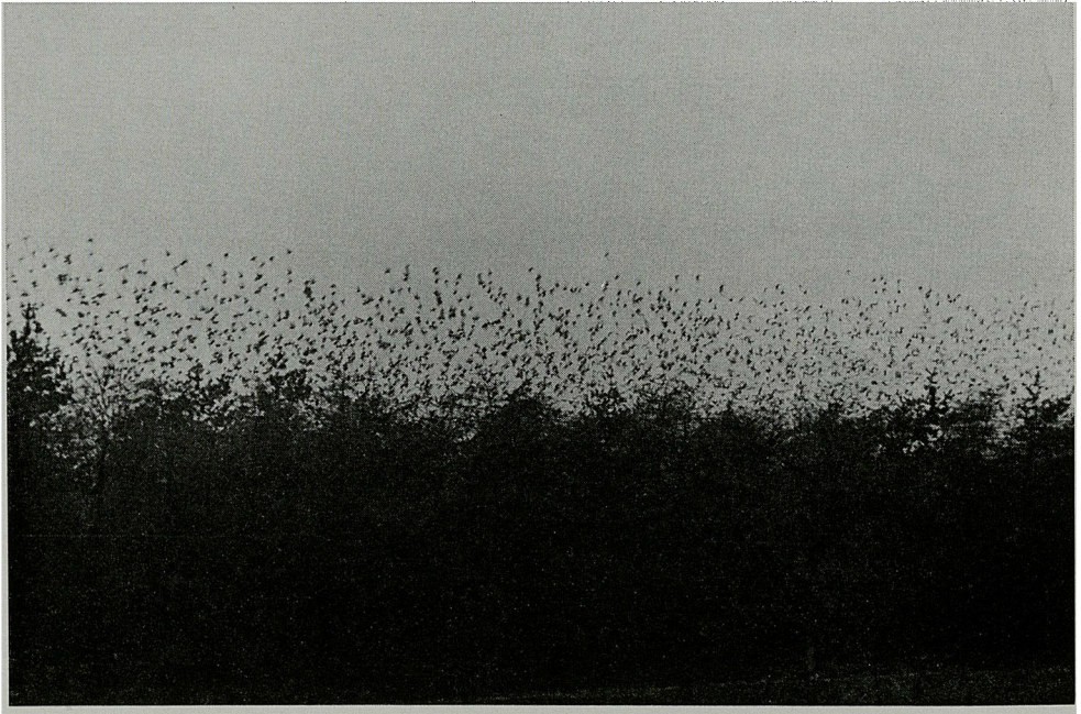
Plate 1. The first flocks approaching a roost. There are over 1,200 birds in this picture.

Front Cover: Roost area shown by browned Sitka spruce.