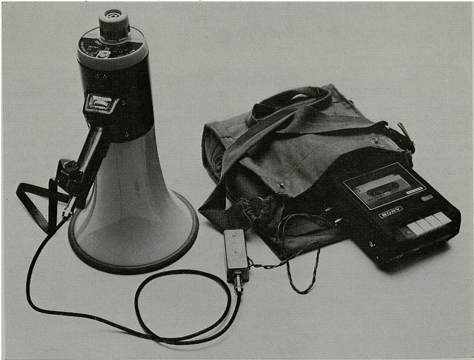
Plate 2. Modified tape-recorder and megaphone ready for use. Spare batteries can be carried in the haversack.

by starlings during the winter (Brodie 1976). Changes resulting from normal forest management, such as clear felling and road building adjacent to roosts may alter local wind patterns causing starlings to vacate otherwise suitable roosting habitat. Broadleaved crops such as beech, occupied by roosts early in the winter, may become unsuitable later when the leaves are shed. Brushing and thinning can induce starlings to leave by reducing the amount of cover available and increasing the airflow through the canopy. It is not economic to alter brushing and thinning regimes to disperse roosts but if these operations are done within a year or so of a roost becoming established there is little point in dispersing the roost by other means.