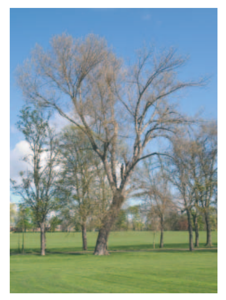
Figure 2 A specimen of an old black poplar tree.

The popularity of black poplar declined in the 19th century following the introduction of the faster growing hybrid between the American P. deltoides and the European P. nigra ( P. x euramericana ). Until recently, there had been very little planting of black poplar since this time and, as a result, the trees which remain today are old and are reaching the end of their lives (Figure 2).