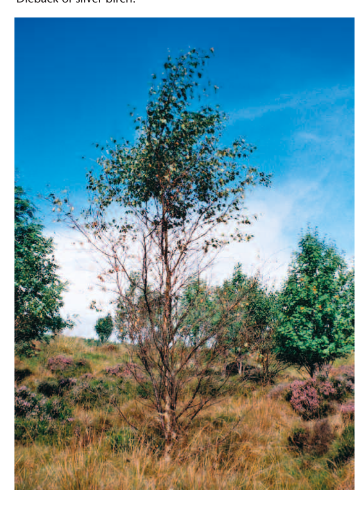
Figure 1 Dieback of silver birch.

During the past few years there have been reports to the Disease Diagnostic Advisory Service of Forest Research of widespread dieback of young, planted birch in Scotland, with over 20 native woodland planting schemes reported as affected to date. Affected trees appear to grow well initially, but approximately 5–10 years after planting begin to exhibit shoot die back from the lower crown upwards and from the outer crown inwards (Figure 1). Symptoms include sunken cankers and fissures on stems and branches, and discrete lesions and tip dieback on young shoots. Although factors such as unsuitable provenance and site selection, poor silvicultural management and climatic damage may contribute to this dieback, the