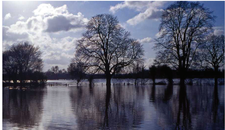
One of the key predicted impacts of climate change is more extreme weather events. The headline-hitting flooding events of the last couple of years are certainly consistent with this aspect of climate change, but we cannot say that they are the result of climate change.