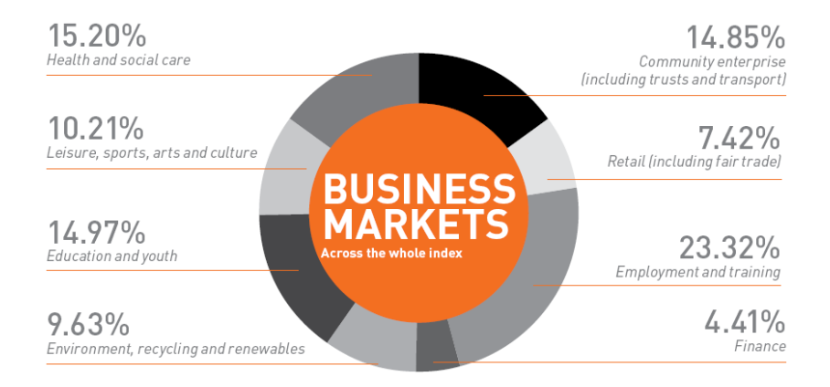
Figure 1. Whole index business markets