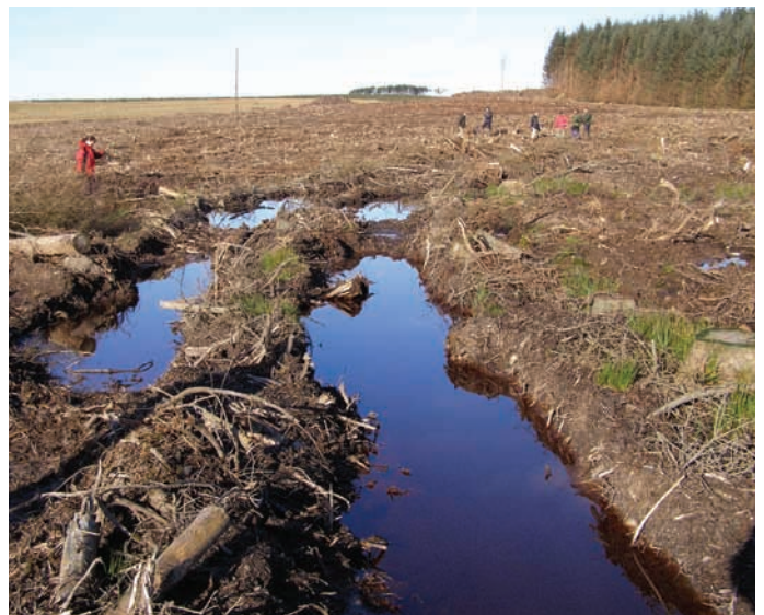
Figure 7 Puddling can cause soil compaction and generate dirty water.

Changes pore size distribution and compaction will affect the amount of water that the soil can store and supply to trees in the next rotation, and the ability of the tree roots to penetrate into the soil. However, there has been no UK research as yet to suggest the scale of probable changes.