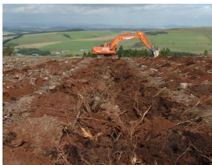
Figure 4 Stump harvesting can cause extensive soil disturbance.

Swedish research suggests that 65–90% of a destumped harvested site may be affected by soil disturbance (Strandström, 2006). In Britain, this degree of disturbance is only likely in unthinned stands although these are extensive (48% of conifer stands in Great Britain, 60% in Scotland). However, for a Sitka spruce stand of Yield Class 12 subjected to mensurational thinning, for example, it is more likely that about 40% of the area will be affected, depending on the degree to which the stumps of trees felled in thinning operations are preserved (E. Mackie, personal communication). Nevertheless, the overall effect of this type of disturbance will be that the soil will lose its physical integrity for a depth of up to 1 m, and become disturbed and mixed over much of the area affected. Soil mixing can lead to other changes in physical, and chemical, characteristics, as discussed below.