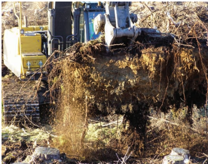
Figure 5 A large volume of soil can remain attached to roots when stumps are extracted from the ground.

Stump and root harvesting also involves the removal of soil attached to and encased within the tree root plates (Figure 5). Estimates from a study in Scotland suggest that soil can make up 17% by weight of the load of stumps removed from site, equivalent to a loss of 22 tonnes per hectare (@ 70% stump removal per unit area) (Saunders, 2008). The amount of soil loss is affected by soil type and harvesting technique (Anerud, 2010). It can be reduced by splitting and shaking the stumps and roots during extraction and then leaving them on site for a period afterwards. Nevertheless, it is inevitable that some soil will be removed from the site, and the soil lost is likely to be the most carbon and nutrient rich – inasmuch as it is mainly derived from the upper soil layers. The consequence of this for site fertility and tree growth in the next rotation has yet to be evaluated.