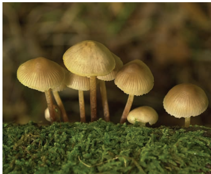
Figure 10 Deadwood is very important for biodiversity.

total removal of stumps, roots and brash is often unacceptable and can have a potentially significant effect on forest fauna and flora, especially those bird, mammal and reptile species that use coarse woody debris for nesting sites. In contrast, stump windrows on or adjoining the site may harbour pest species such as rabbit, which could pose a problem for restocking.