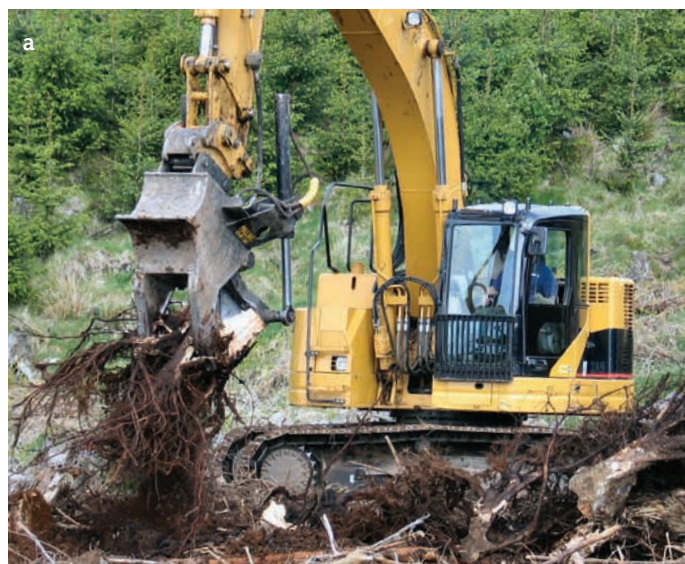
Figure 1 A tracked excavator (a) fitted with a stump removal head (b).

However, the stumps and roots of trees contain organic materials that contribute to the cycle of carbon between the biosphere and the atmosphere. When stumps and roots are left