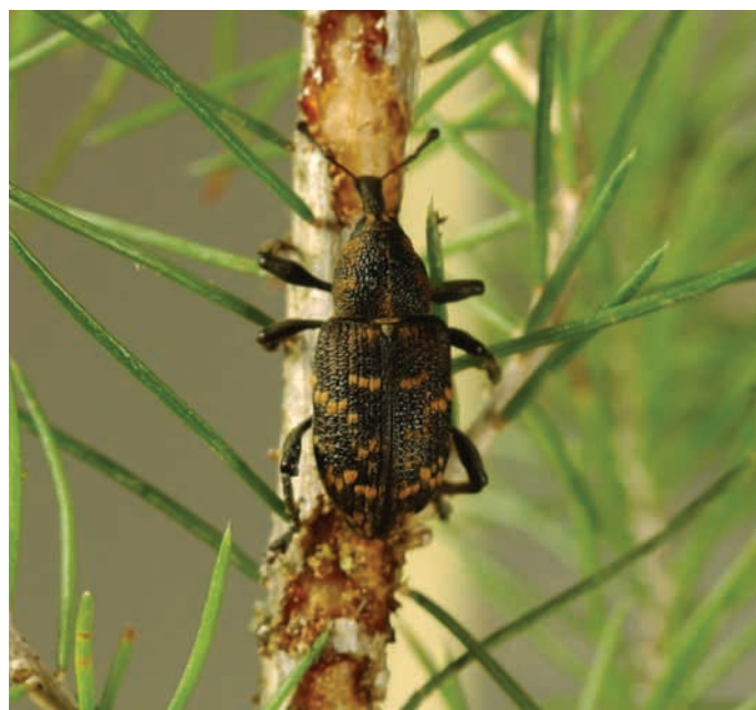
Figure 11 Large pine weevils, which inhabit tree stumps, can be a major cause of damage to trees if left untreated.

The main insect pest associated with tree stumps in the UK is the large pine weevil ( Hylobius abietis ), which can emerge from stumps after clearfell to attack newly planted trees (Figure 11).