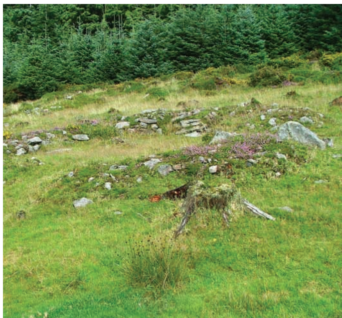
Figure 12 Stump removal is a threat to buried prehistoric sites and artefacts of archaeological importance.

Soil disturbance is a threat to buried sites and artefacts of archaeological importance through both direct physical damage and a loss of their context within the soil horizons – making interpretation and dating almost impossible. Hence stump harvesting is incompatible with preservation of archaeological evidence and should not take place where important remains are known to occur, e.g. on scheduled archaeological sites (Figure 12). On other sites, it is important to undertake an assessment of likely occurrence based on a landscape evaluation of human occupation coupled with expert opinion and known archaeology in the area. Advice in the UKFS Guidelines on Forests and Historic Environment (Forestry Commission, in press, c) should be followed.