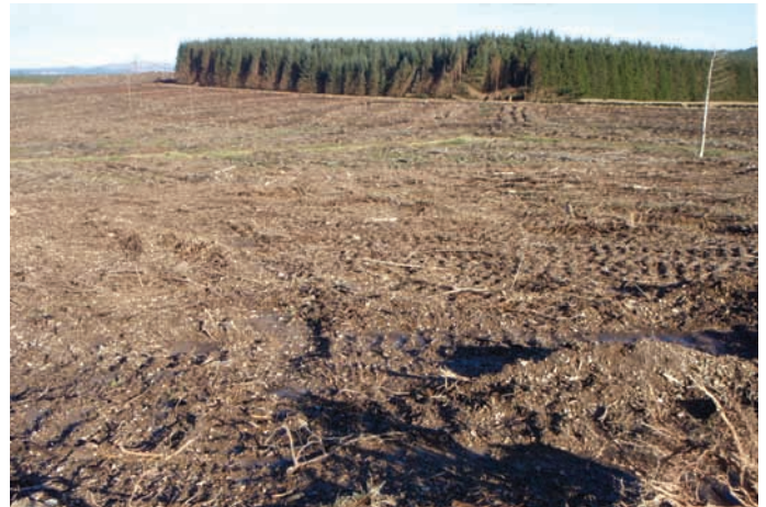
Figure 6 Additional trafficking due to stump harvesting can lead to ground damage and soil compaction.

component of stony material (B.C. Ministry of Forests, 1999). Puddling can lead to soil sealing, compaction and erosion, and hinder the establishment and growth of subsequent rotations. Changes to soil bulk density have been reported in overseas studies (e.g. Page-Dumroese et al. , 1998; Hope, 2007; Vasaitis et al. , 2008), though there is no clear picture of positive or negative change and it seems very dependent on soil type and soil conditions at the time of stump removal operations. There is also a risk of increased compaction and rutting in the extraction routes, due to extra machine passes associated with stump and root harvesting. This can lead to increased surface run-off and local surface water peak flows.