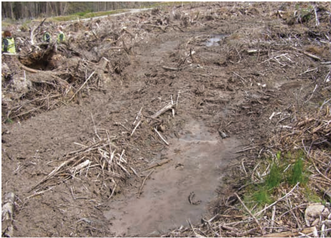
Figure 8 Ground damage can readily lead to soil erosion.

above. The risk of soil erosion is also increased when soil is left exposed at the surface, for example, after destumping operations. On sloping land, risk is compounded the more of the land surface that is exposed. Another factor influencing the risk of soil erosion is the presence of the tree root system, especially the fine roots, which bind the organic and mineral soil together (Ruebens et al. , 2007). These are largely removed from the surface soil horizons during destumping.