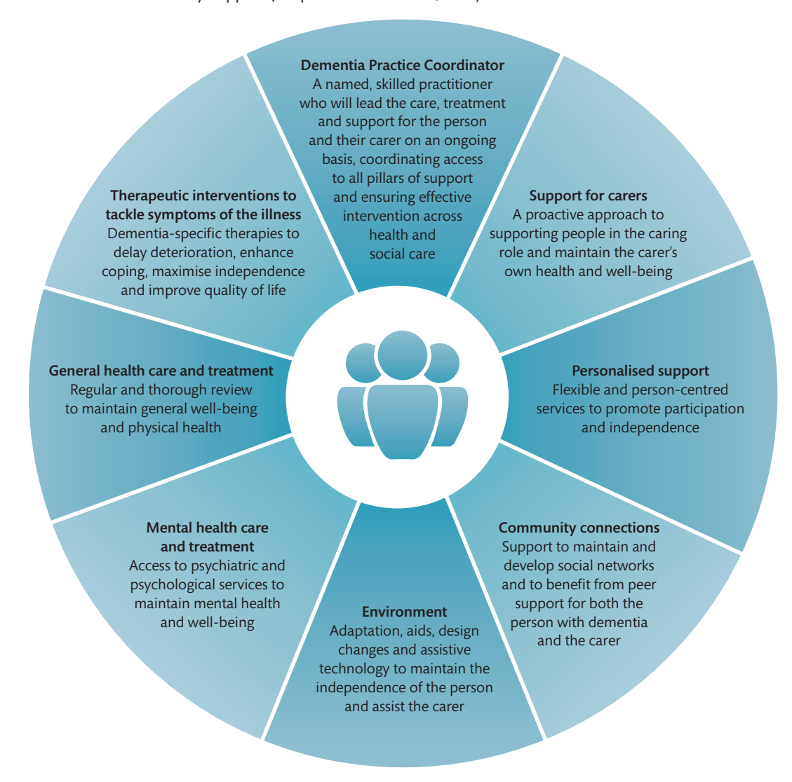
Figure 1 The 8 Pillars Model of Community Support (adapted from Kinnaird, 2012).

Forestry Commission Scotland recognises the important role that trees, woods and forests can potentially play in the enhancement of the population's health and well-being and this has been a central theme in recent forestry policies and strategies. 'Improved health and well-being of people and their communities' is one of three outcomes set out in the Scottish Forestry Strategy (Scottish Executive, 2006), while 'Make access to woodlands easier for all sectors of society' and 'Use woodland access to help improve physical and mental health in Scotland' are two of the purposes listed under 'Access and health', one of the strategy's seven key themes. The Woods for Health Strategy (Forestry Commission Scotland, 2009) focuses on the potential health and well-being benefits offered by