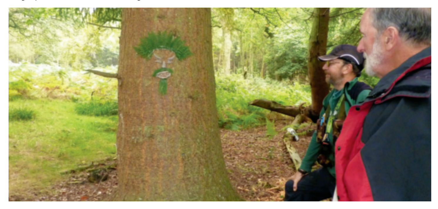
Using clay and natural materials to create a green man on the tree trunks.

The aging process can be associated with stigma and negative stereotypes, so when an older adult is diagnosed with dementia, he or she is faced with the double stigma of being older and having memory problems. He or she may experience the loss of valued roles and identities as society enforces negative misunderstandings and expectations on persons living with dementia (Olsson et al. , 2013). Dementia can also affect younger people (usually between 30 and 65 years of age). Alzheimer's disease is the most common form in younger people. Although younger people experience similar symptoms to older people