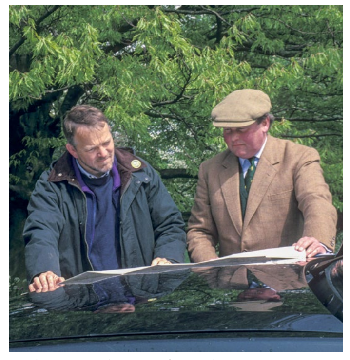
Land managers discussing forest planning.

Our research explores mechanisms for delivering tree and forest ecosystem services and examines land managers' perspectives in relation to mechanisms.