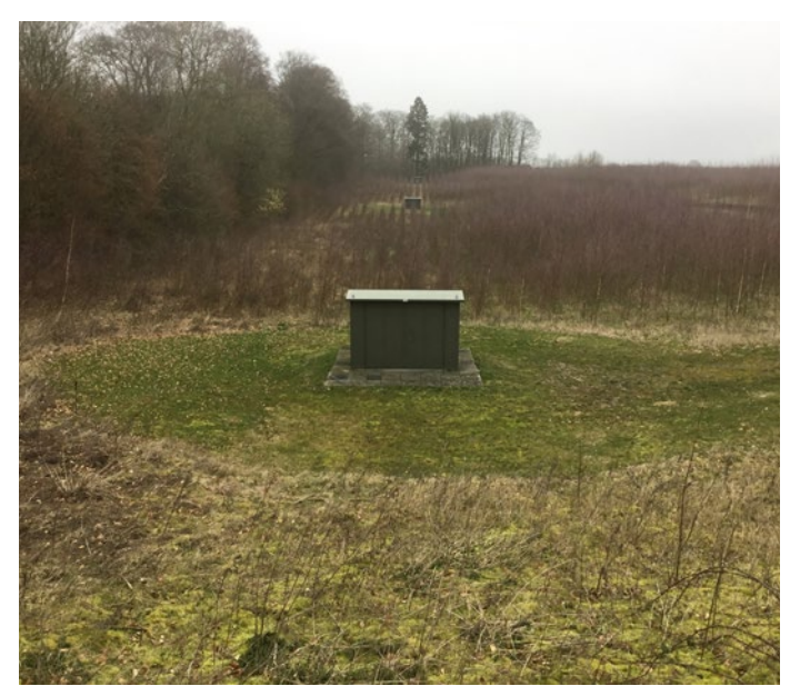
Tree planting around three boreholes to improve and protect the groundwater supply for a small town in Denmark as part of a PESFOR-W scheme.