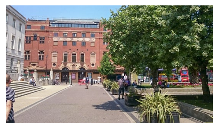
Urban trees providing shade, colour and shape within a civic space, Hackney, London.

• We have defined 'Urban forest ecosystem services' as a separate classification. It reveals the importance of tree management, location, proximity to people, land use and ownership to the delivery of benefits, as well as whether trees are isolated or in a group. This is helpful in informing urban forest planning and management.