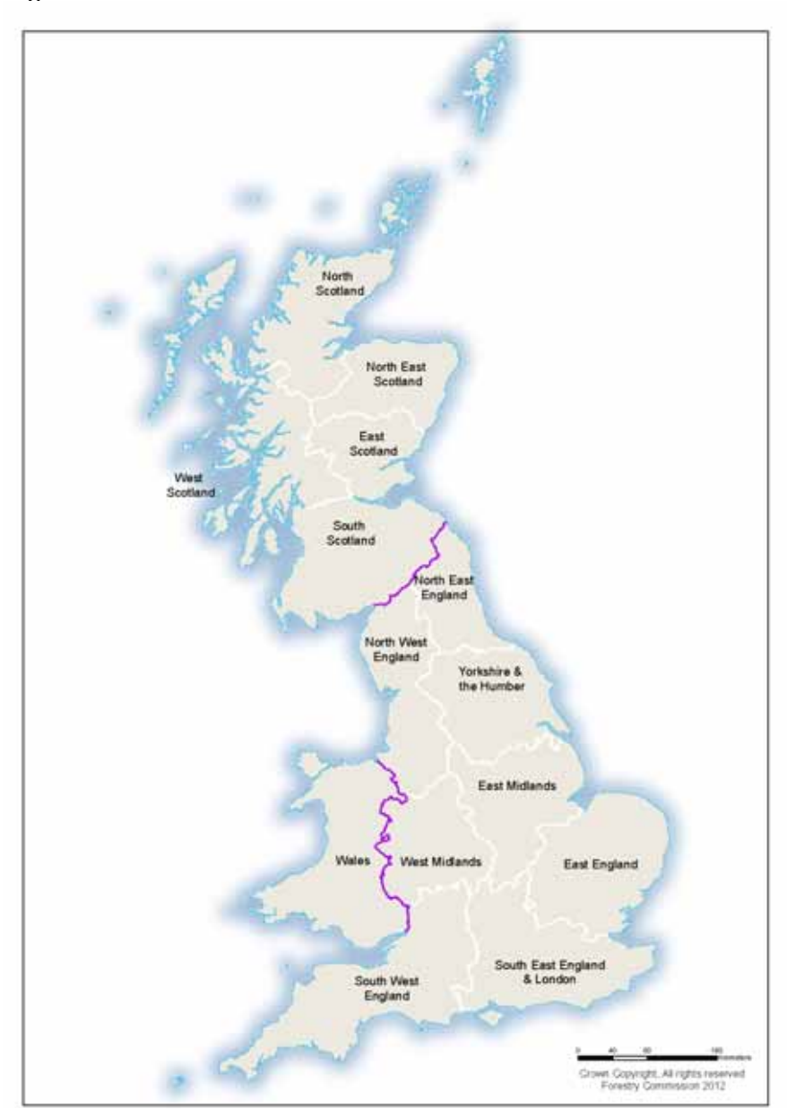
Figure 1-1: National Forest Inventory main reporting units

All information gathered is held in the strictest confidence, and it will not be used to police, regulate or directly affect management of individual woods in any way. Information will only be published in a summary form that does not reveal information about individual woodland holdings. The main reporting units (Great Britain, country and regional) are shown below, and although "customised" reports might also be produced for some smaller areas, these, too, will not reveal any information about individual woodland holdings.