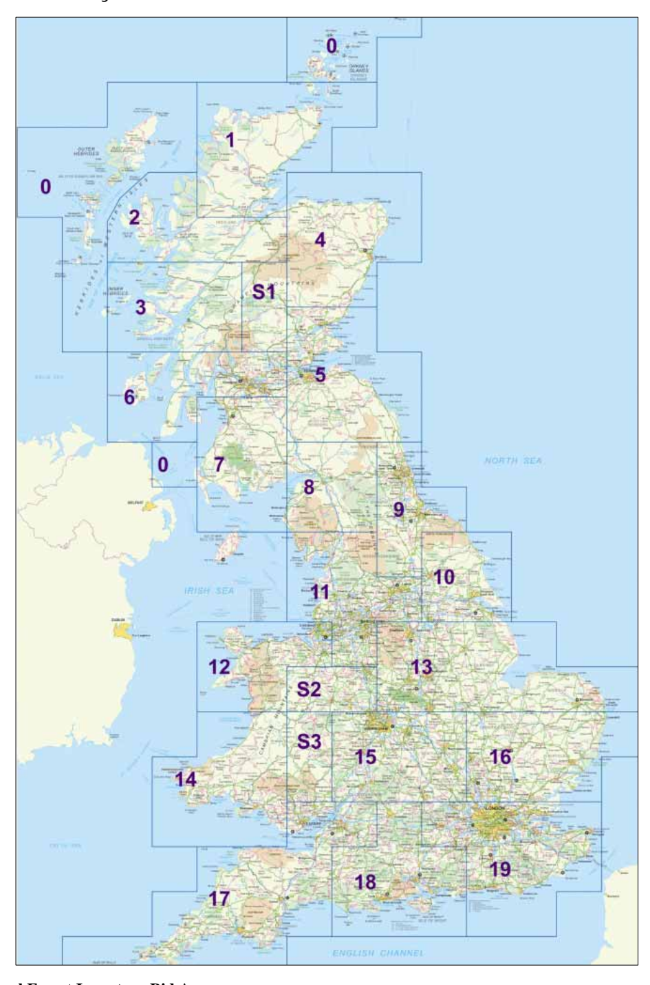
Figure 1-2: National Forest Inventory Bid Areas

For the purposes of managing the framework contractors, Britain has been split into 22 Bid Areas (see Figure 1-2 below). Within each Bid Area, the NFI Sample Squares are allocated to one survey team.