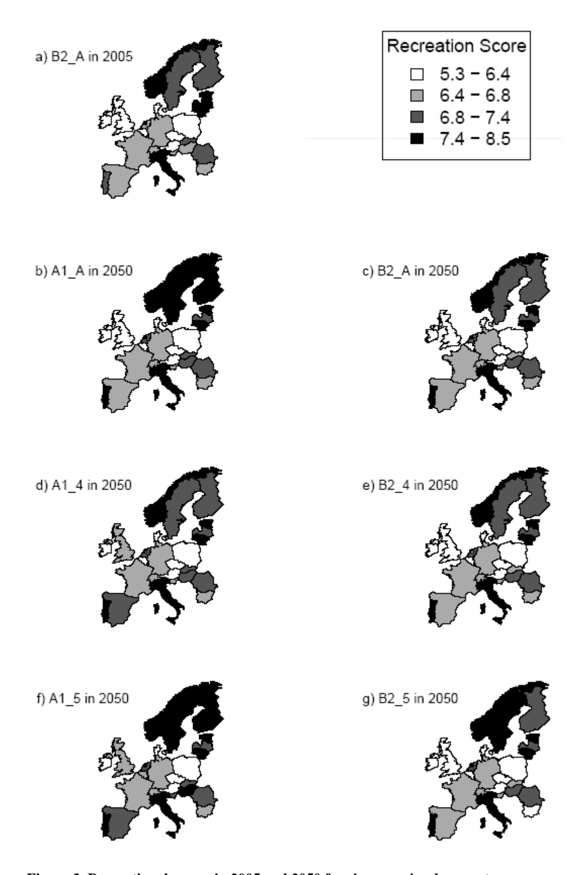
Figure 3. Recreational scores in 2005 and 2050 for six scenarios, by country