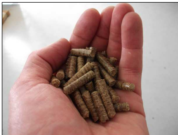
Figure 9 – Rhododendron pellets

However due to excess moisture levels the pellets produced on the first pass were not acceptable. When fed through the pellet press a second time the pellets produced were of a good consistency and high durability. A sample of these pellets was selected for laboratory testing against the European Quality Standards.