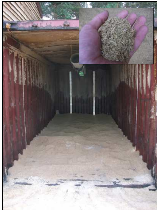
Figure 1 – 20 foot shipping container used to dry rhododendron fibres