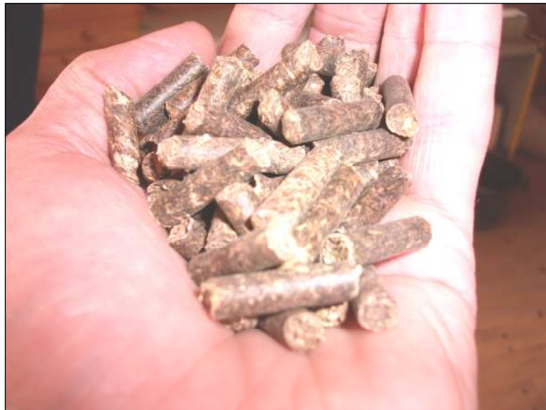
Figure 12 - Heather pellets formed at low moisture level of raw material

The experience of pelleting gorse, rhododendron and heather during the current trials suggests that handled correctly each of these raw materials can be successfully pelleted using a conventional wood pellet production plant. The laboratory test results will show to what extent the pellets produced may be regarded as a suitable fuel for wood pellet boilers.