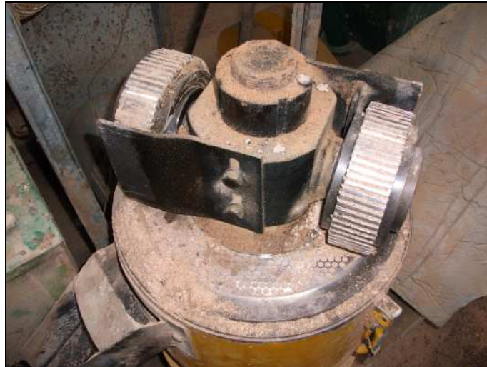
Figure 8 – Flat plate die and rollers

The pressure and heat generated cause the lignin in the biomass particles to melt and bind the fibres together, forming a pellet which exits the underside of the die. The pellets then enter a rotary sieve/ cooling chamber where fine material and heat are removed using an air extraction system.