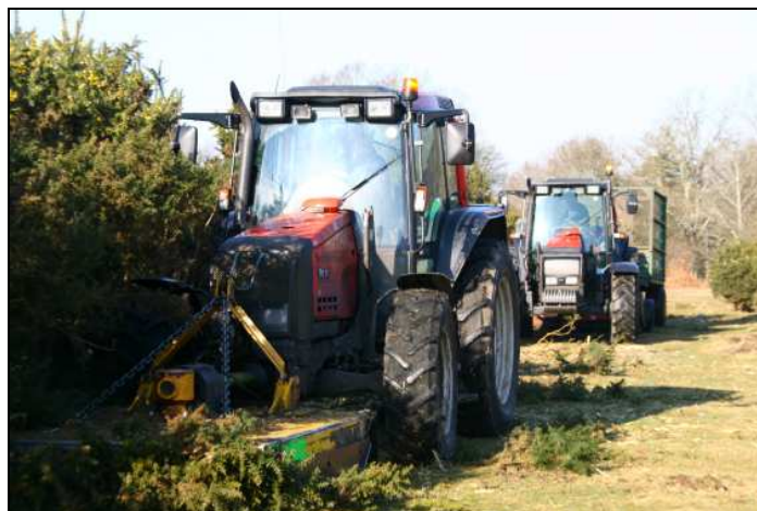
Figure 2 – Front mounted tractor mower

This method of collection does not provide the medium best suited for pelleting as a significant quantity of earth and material other than gorse is also collected; this is likely to detrimentally affect pellet quality. However, it was decided to use the material harvested and to assess quality and make recommendations for future alternative harvesting methods according to the results.