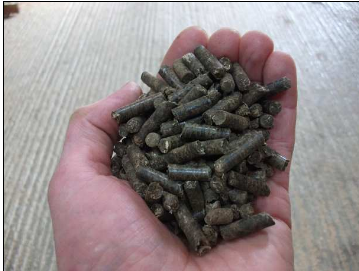
Figure 10 – gorse pellets