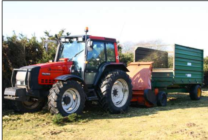
Figure 3 – Single chop forage harvester and trailer

Approximately 10m 3 of chopped gorse was delivered to site on Friday 26 th March in a tipper truck. The material was tipped into the pellet factory in order to keep it undercover for drying purposes. The measured moisture content of the recently harvested gorse on 7 th April, 2010 was 35%. As with the rhododendron a portion of the chopped gorse was hammer milled and spread out to air dry in a 20 foot shipping container, where it dried to a moisture level of 15% over a period of 4 weeks.