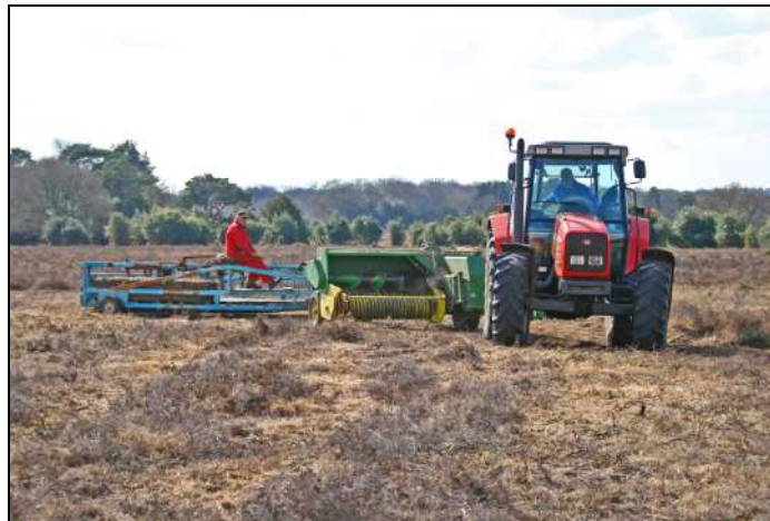
Figure 4 – Agricultural baler and bale sled

Once the baling is completed the bales are collected using a 12-bale grab that is attached to the tractor's loader (see Figure 4). Once loaded, the bales are either transported to a work site where they will be used for mire or river restoration, or taken to a storage area for later use. As with the gorse this method of harvesting and collection does not provide the medium best suited for pelleting as there is likely to be significant contamination of earth and material other than heather, which will detrimentally affect pellet quality. Other, potentially more suitable harvesting methods should be considered.