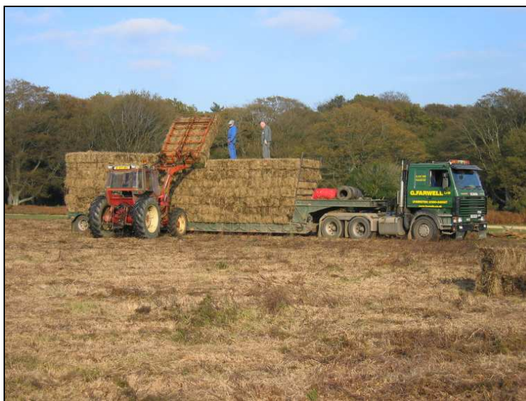
Figure 5 – Bale grab and loading

Approximately 50 bales of heather were delivered to the pellet production plant on the same day as the gorse (26 th March, 2010) in a tipper truck. As with the gorse these were stored inside the pellet factory to ensure the material was kept dry (see Figure 6). The measured moisture content of the heather on 7 th April, 2010 was 20%.