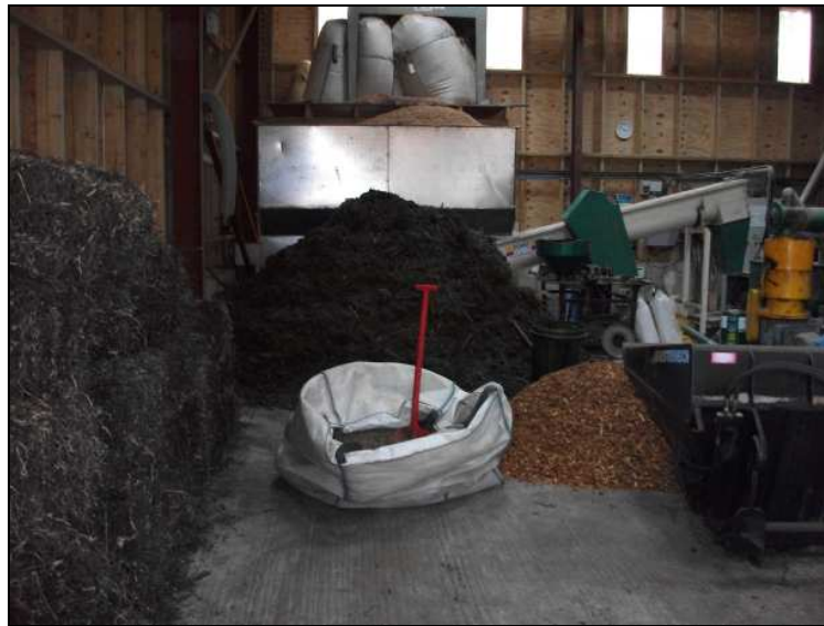
Figure 6 – Heather bales, chopped gorse and chipped rhododendron in factory