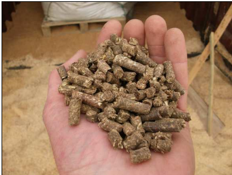
Figure 11 – Heather pellets formed at high moisture level of raw material

There was a significant improvement in the quality of pellets formed on the second press – i.e. when the moisture content of the raw material was lower (see Figure 12). A sample of these pellets was sent for testing in June 2010.