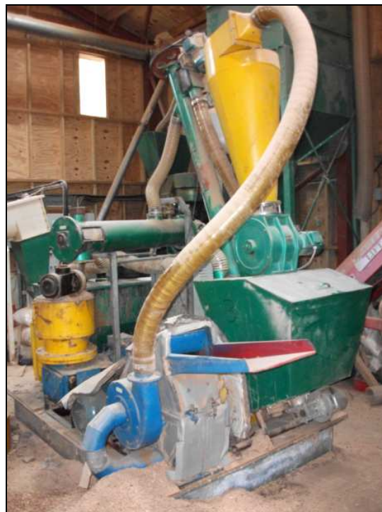
Figure 7 – 22kW Flat plate die pellet press

The first stage of the pellet production, once the material was sufficiently dry, was to reduce the particle size of the raw material in order for it to be pelleted. This was done using a hammer mill (the red and blue machine in Figure 7). The hammer mill