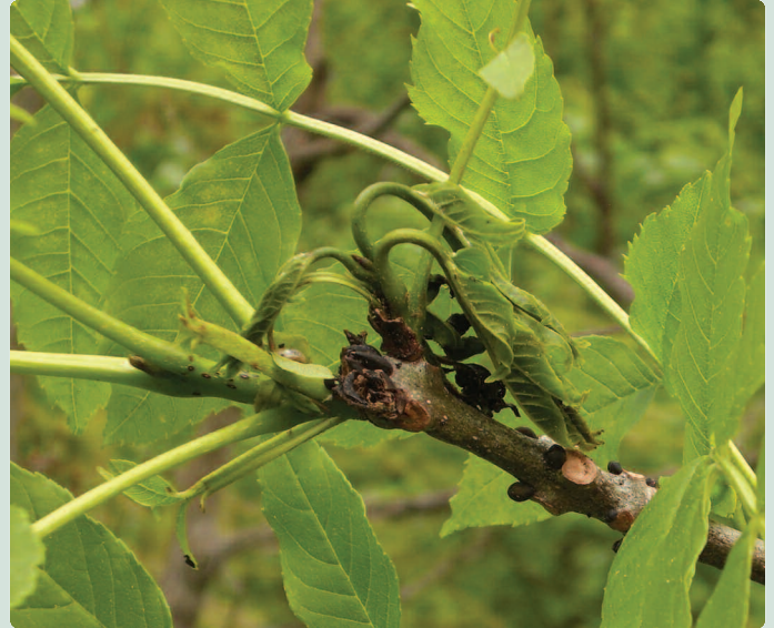
An ash tree infected with Chalara fraxinea , sometimes known as Hymenoscyphus pseudoalbidus (which describes another life stage).

Ash dieback is a disease of ash trees caused by the fungus Chalara fraxinea . The disease causes leaf loss and crown dieback in affected trees and often leads to tree death. Ash trees showing symptoms of Chalara fraxinea are now widespread across Europe and in 2012 it was detected for the first time in Britain – initially in a consignment of infected trees sent from the Netherlands to a nursery in the south of England, but later in trees planted in the natural environment. Surveys have now confirmed the presence of ash dieback disease at more than 150 locations in England and Scotland, including established woodlands. Chalara fraxinea is being treated as a quarantine pest under national emergency measures; it is important that suspected cases of the disease are reported.