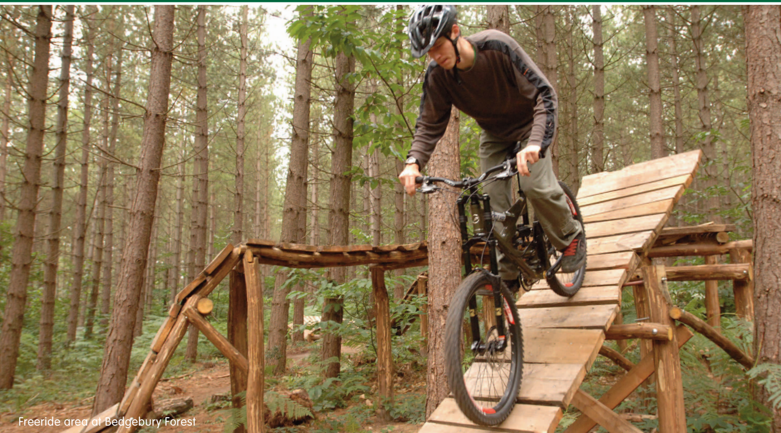
Freeride area at Bedgebury Forest