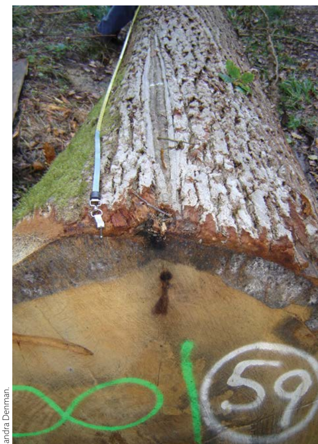
Figure 5 Seam indicating a partially healed frost crack. Note the corresponding split in the wood beneath it. In this instance the dark staining is not thought to be bacterial wetwood and may be associated with a Phytophthora .

Frost cracks may heal more or less effectively: a healing wound is still likely to be visible for some years as a seam (Figure 5), but may also be aggravated by continuous reopening in subsequent winters leading to the formation of a prominent rib (Figures 6 and 7) due to the repeated in-rolling and separation of successive layers of healing tissue (Rishbeth, 1982; Kubler, 1983). Note that rib-like features may also have their origin in other aspects of tree architecture and should not be taken as a reliable indicator of the presence of shake.