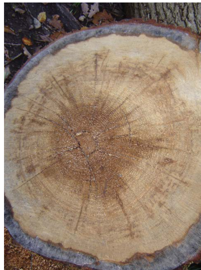
Figure 3 Severe star shake with extensive brown staining present indicating presence of bacterial wetwood (chalky deposits are also visible in these shakes).

internally infused with water from an internal source (Ward and Pong, 1980). Anaerobic bacteria are known to invade damaged tissue and are better able to colonise wood where there is high natural moisture content, as is common in healthy oak trees particularly during periods of very wet weather. These bacteria may break down the middle lamella between the cell walls resulting in the separation of cells and the potential for formation of shakes (McGinnes, Phelps and Ward, 1974; cited in Henman, 1986a). Very wet and waterlogged soil, a known characteristic of shake-prone sites, will further increase sapwood moisture content (Cinotti, 1989).