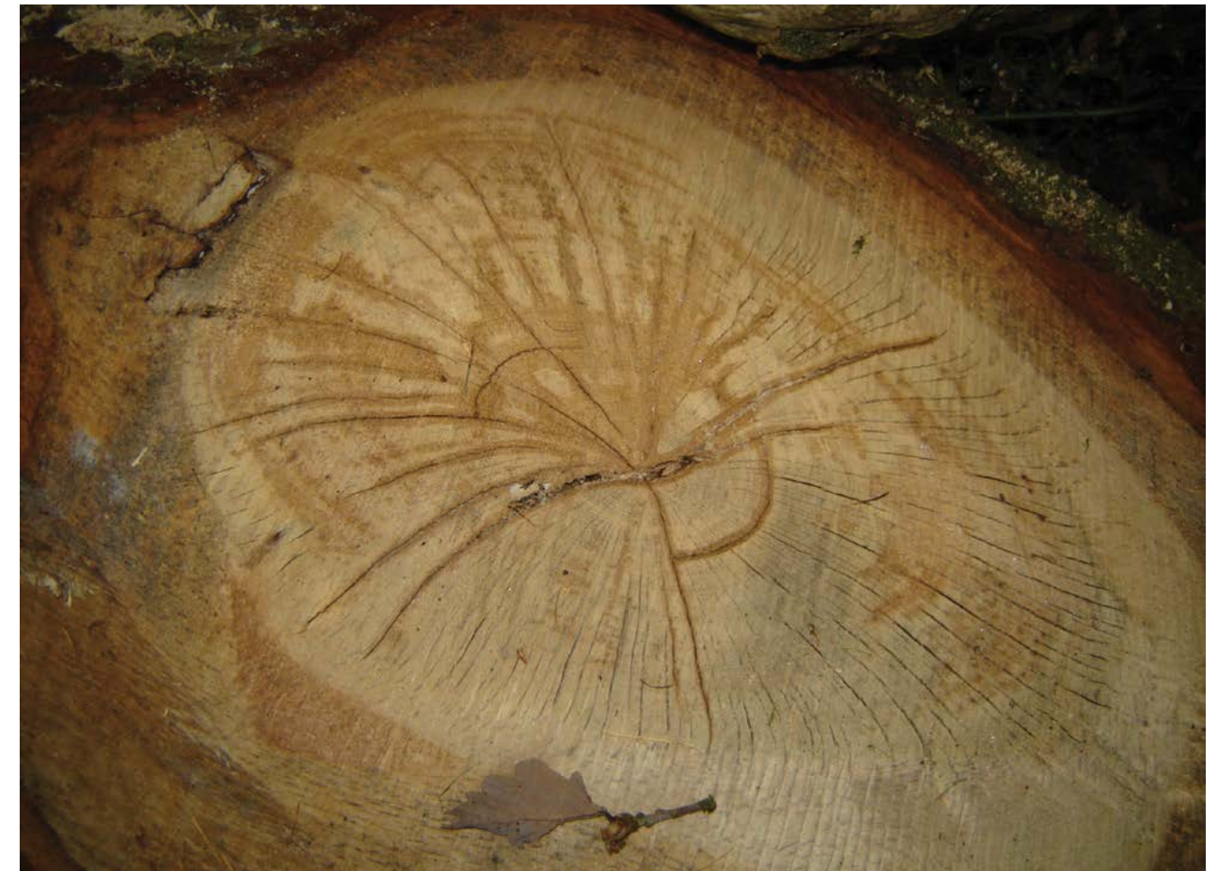
Figure 1 Star and ring shakes present in the same log (the unstained cracks are natural 'checks' caused by the drying-out processes).

Current UK forest policy (Scottish Executive, 2006; Welsh Assembly Government, 2009; Defra, 2013) is to significantly increase forest cover and to improve the economic potential of broadleaved woodland, much of which is of low financial value. The level of investment required to establish oak for better quality timber production is relatively high and rotations are normally very long (up to 150 years). A better understanding of the factors influencing shake will enable