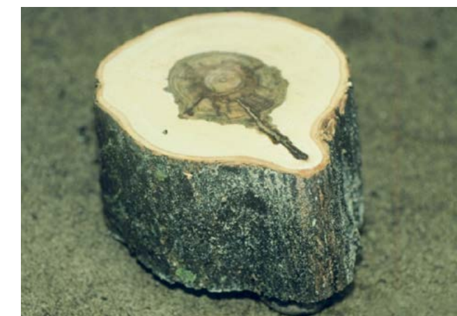
Figure 6 Prominent rib caused by the ongoing reopening and healing of a frost crack originating in bacterial wetwood (dark stained area).