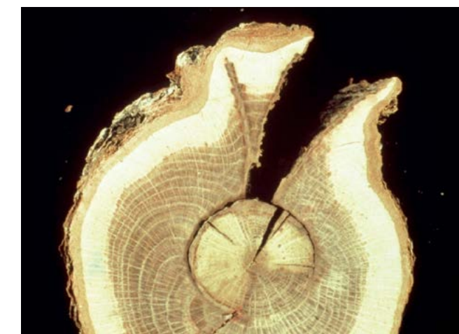
Figure 7 Severe and unhealed frost crack that may have originated in the extensive ring shake.