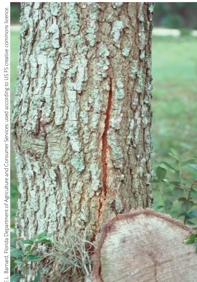
Figure 4 Frost crack in oak.