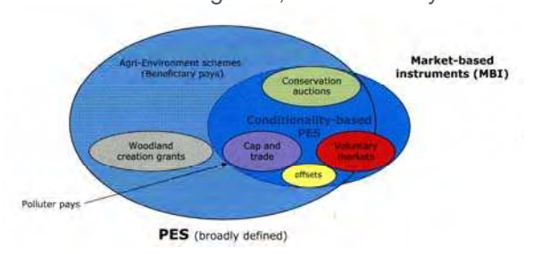
Figure 1 Types of PES Schemes

PES mechanisms are highly adaptable and have already been applied to a wide range of contexts and ES, including carbon sequestration, habitat protection, landscape conservation and various hydrological services (see: Morrison and Aubrey, 2010, Table 3, p.8). As shown in Figure 1, PES schemes differ in: the extent of voluntary transactions; how well the ES are defined; and whether payments just depend upon altered land use (e.g. increasing tree cover) and projected changes in ES provision, or monitoring their increased delivery ex-post ('conditionality'). A number of economists (e.g. Morrison and Aubrey, 2010) consider the last point to be a defining characteristic of PES. Schemes also differ in relation to principles underpinning associated property rights. Some - including mandatory 'cap-and-trade' and 'offset' schemes, are based on the WFD 'polluter pays' principle (EU, 2000, para 38, p.7). Others draw on the 'beneficiary pays' principle, which underpins woodland creation grants, and voluntary markets for ES driven by corporate social responsibility.