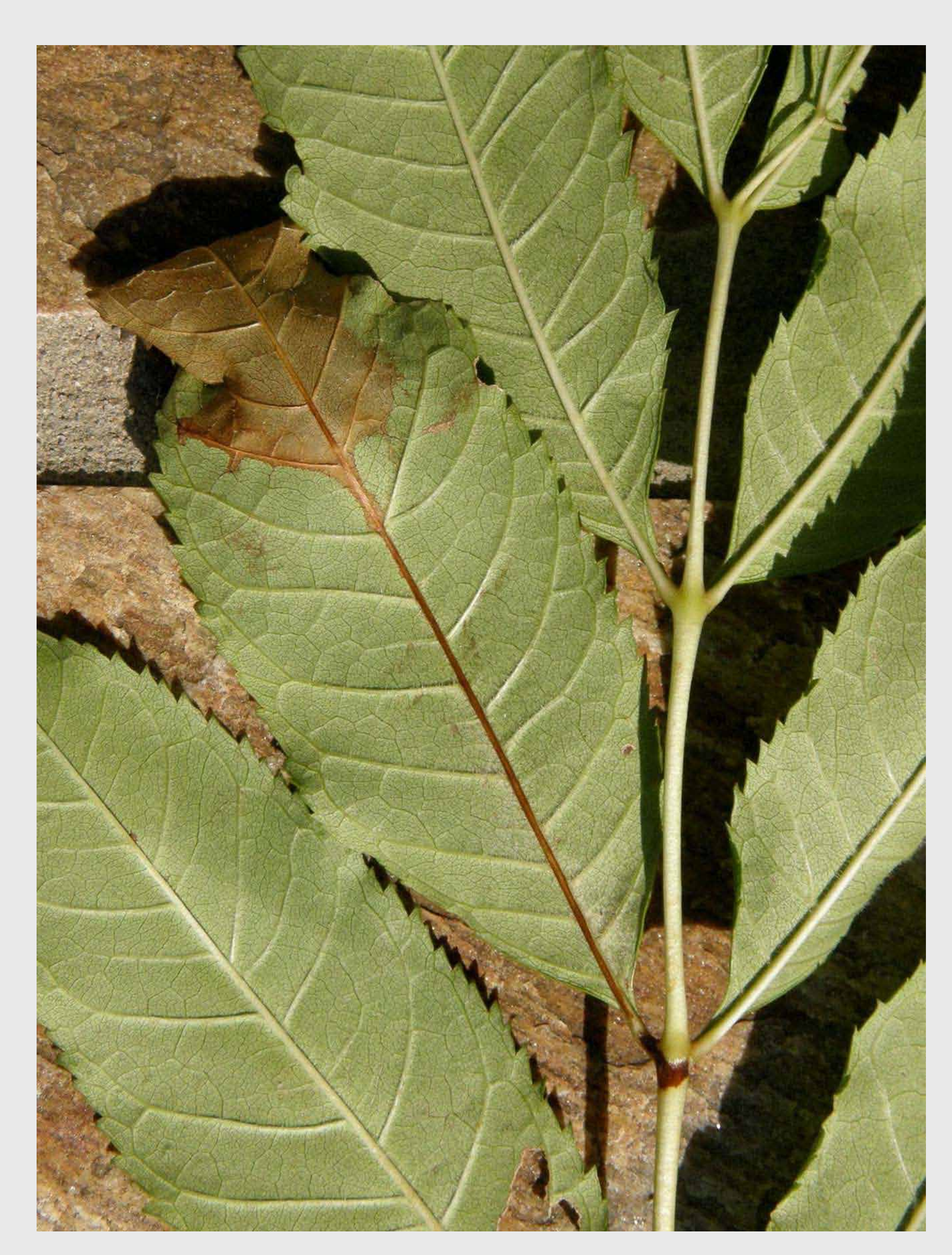
Shoot wilting and leaf necrosis.