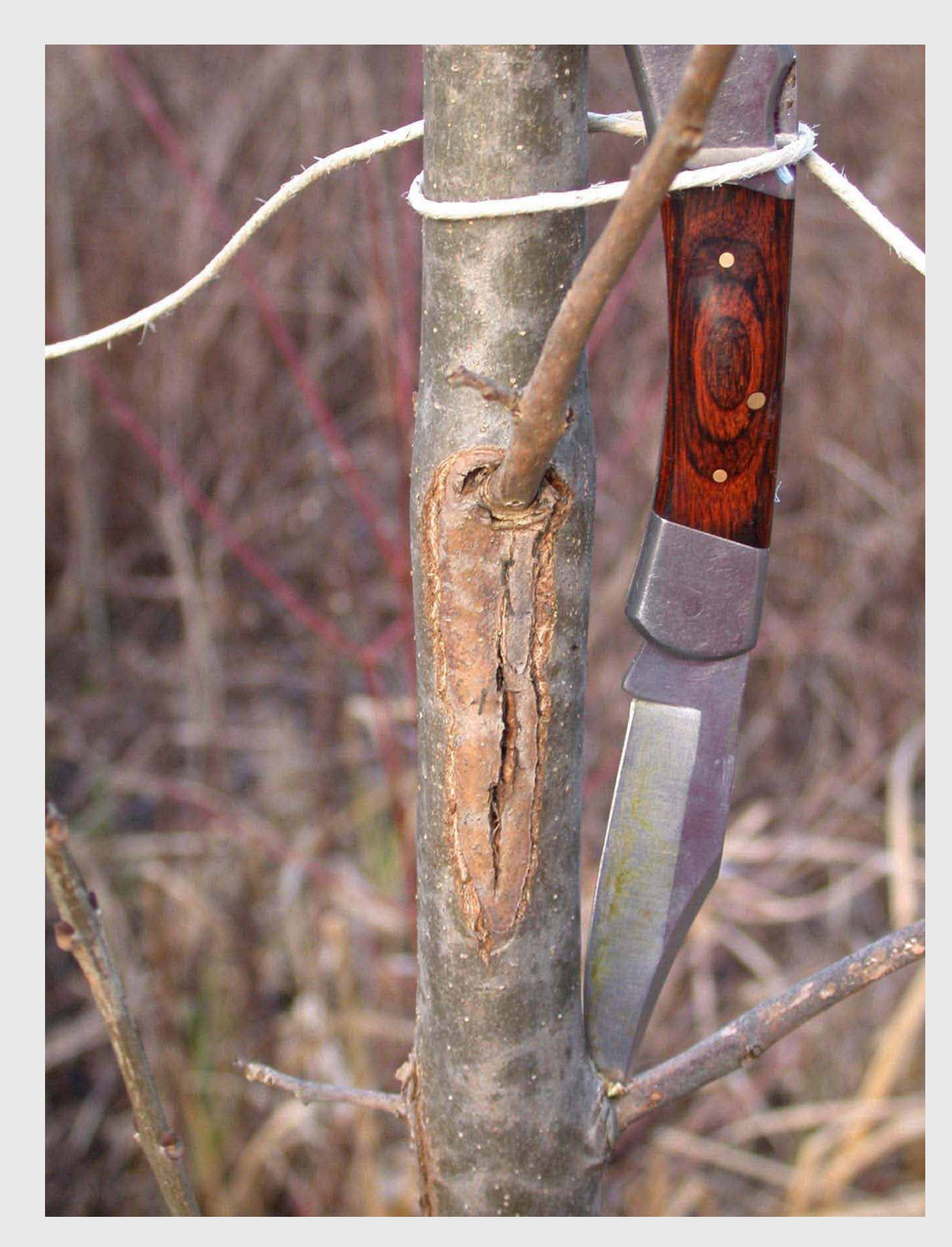
Stem lesions on affected stems and branches.