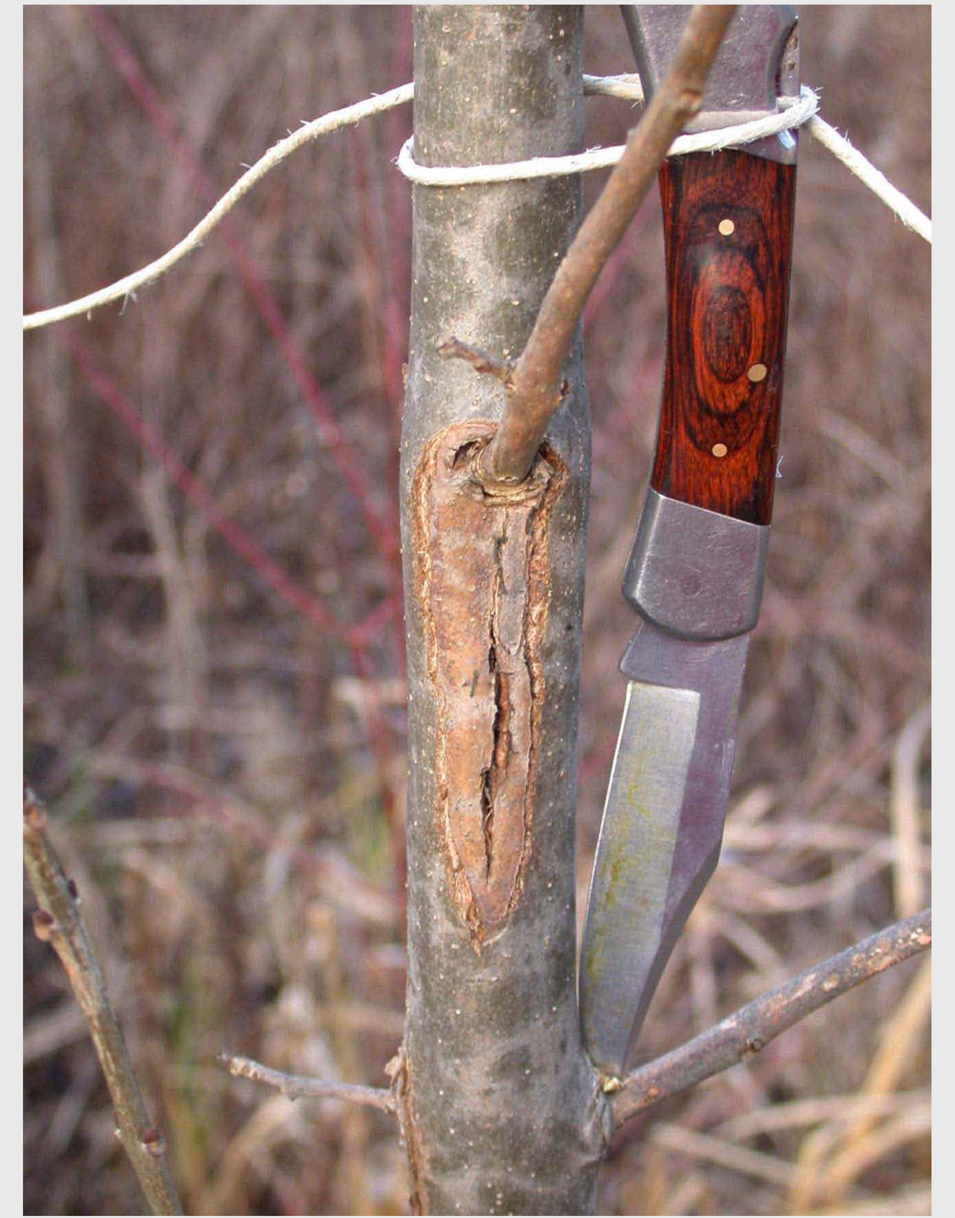
Stem lesions on affected stems and branches.