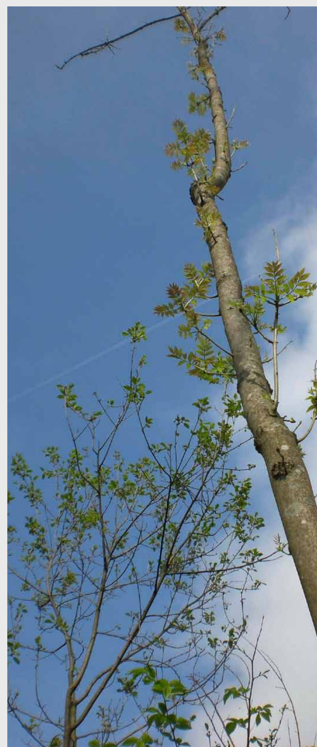
Extensive dieback and withered foliage on affected ash trees.