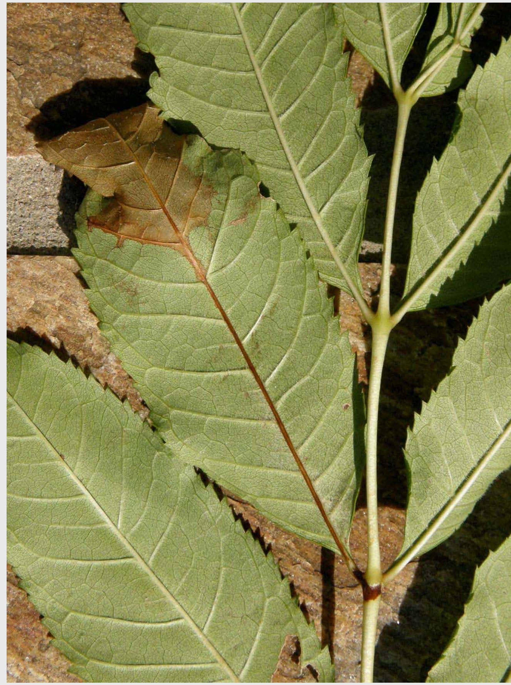
Shoot wilting and leaf necrosis.