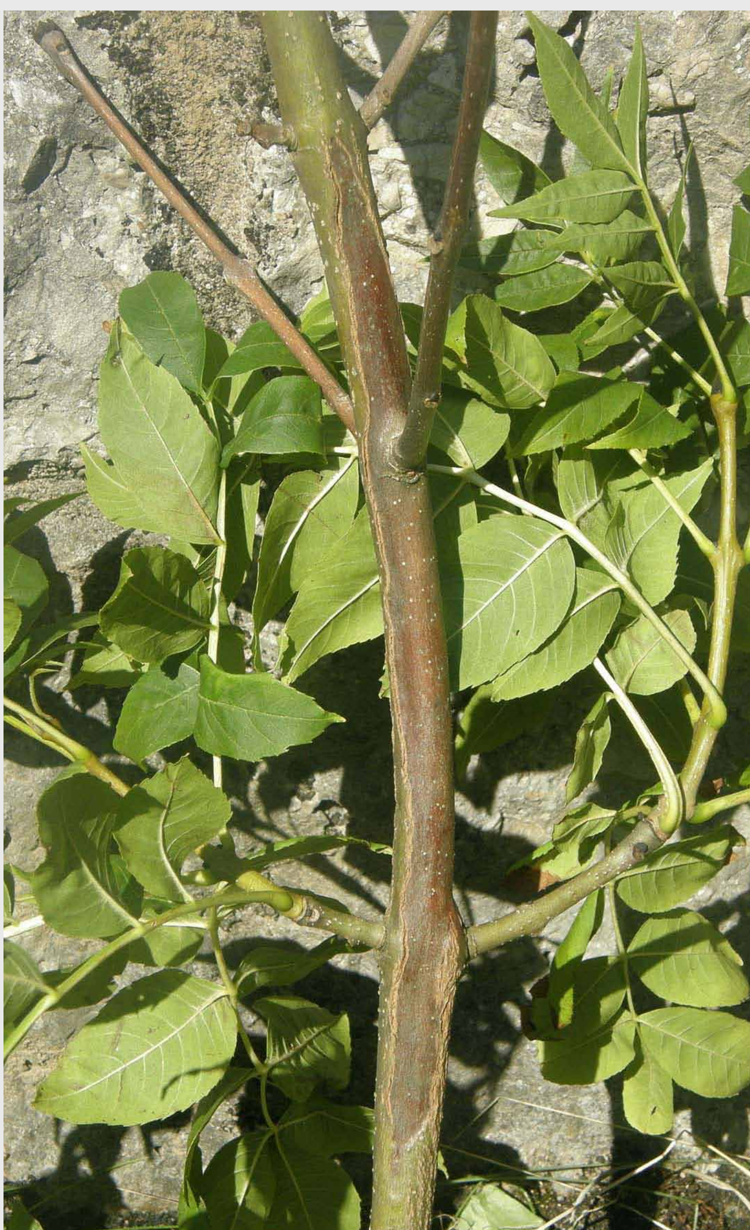
Stem lesions on affected stems and branches.