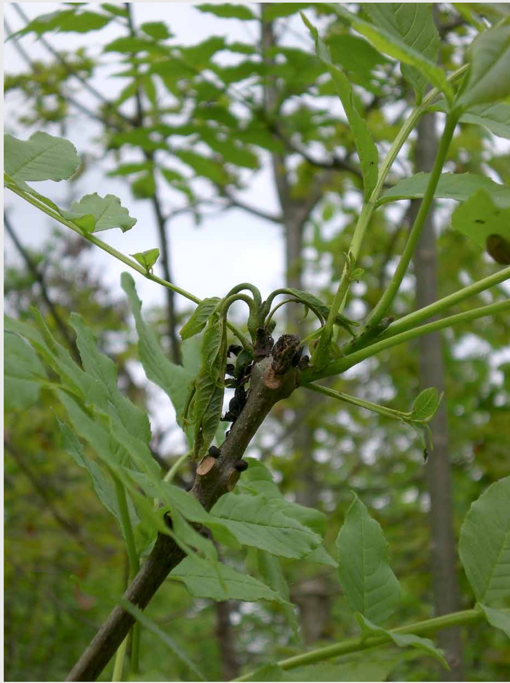
Shoot wilting and leaf necrosis.