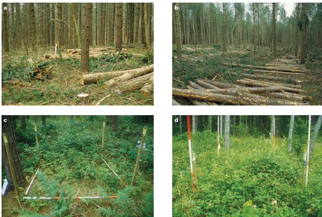
Figure 1 (a), (b) Examples of treatment plots immediately after felling and (c), (d) permanent quadrats after four years' growth (a, c = 20%; b, d = 80%).

It is generally accepted that restoring PAWS to native woodland will enhance woodland habitats for a range of plant and animal species, but the potential for success will vary with the remnant features present on the site and the methods used. Current guidance suggests that restoration should take place gradually using some form of continuous cover forestry to maintain woodland conditions while the planted species are removed and native broadleaves regenerate naturally. While this method may have a number of potential benefits (e.g. no major disturbance to fauna, retention of moist microclimates for epiphytes and deadwood invertebrates, control of ground vegetation by the presence of overstorey cover) it has never been adequately tested. This article briefly describes some of the studies within lowland PAWS that were established to examine current guidance and improve advice.