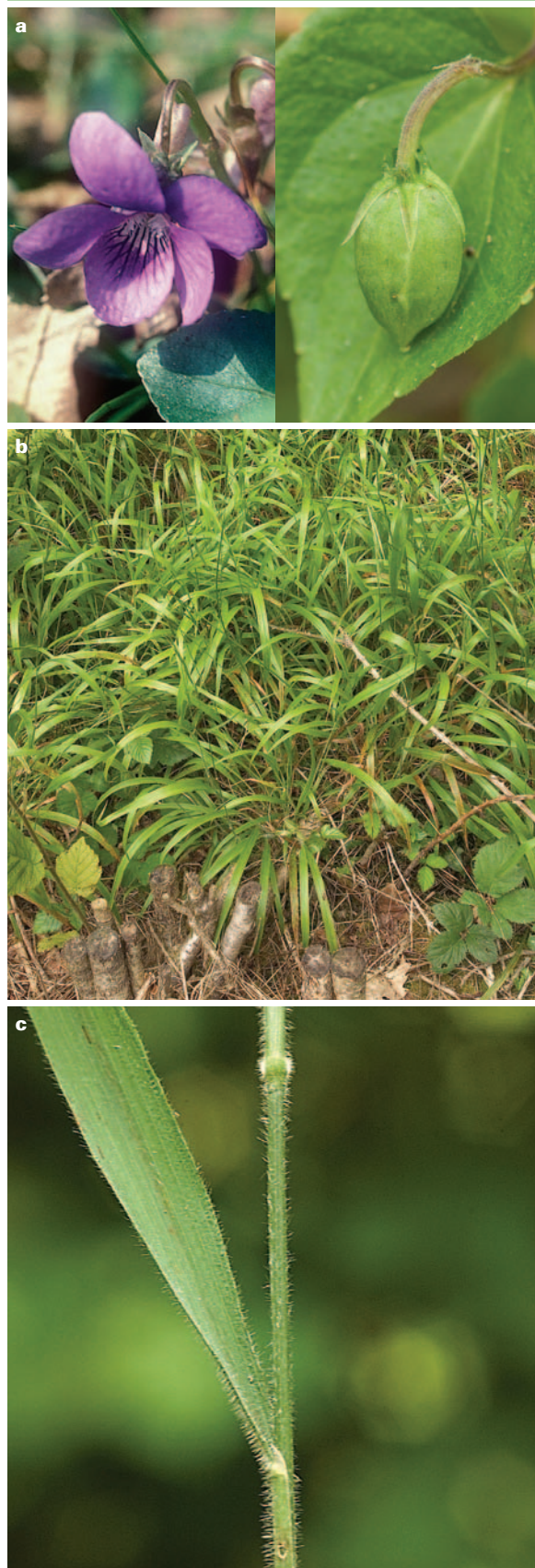
Figure 2 (a) Common violet flower and seed pod, (b) wood false-brome and (c) close up showing node and fine hairs on stem which can be useful in identification.

The abundance of most species was low and only nine species ever exceeded 5% cover on any quadrat on which they were present. Bramble was the most abundant species and by 2005 the site was becoming dominated by a dense thicket. More than half of the quadrats had 50% or more bramble cover but this varied with treatment. The height of the bramble thicket increased with time: by 2005 the height of that in the 80% thinning plots was twice that in the 20% plots (Figure 3). The response of bramble was expected and detailed studies to investigate its growth have been made in all thinning treatments (see Box 1).