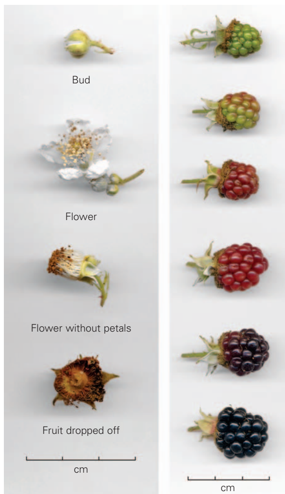
Figure 4 Different stages of flower and fruit development in bramble.

Flowering and fruiting of bramble was assessed by counting numbers of inflorescences and recording fruit development using ten categories from an unopened bud to a ripe blackberry (Figure 4). Seeds were extracted by mashing the fruits through a sieve and their quality was assessed by cutting them in half and observing them under a microscope. A seed was either filled with live embryonic and storage tissue or it contained a collapsed embryo whose tissue was dry and shrivelled (Figure 5).