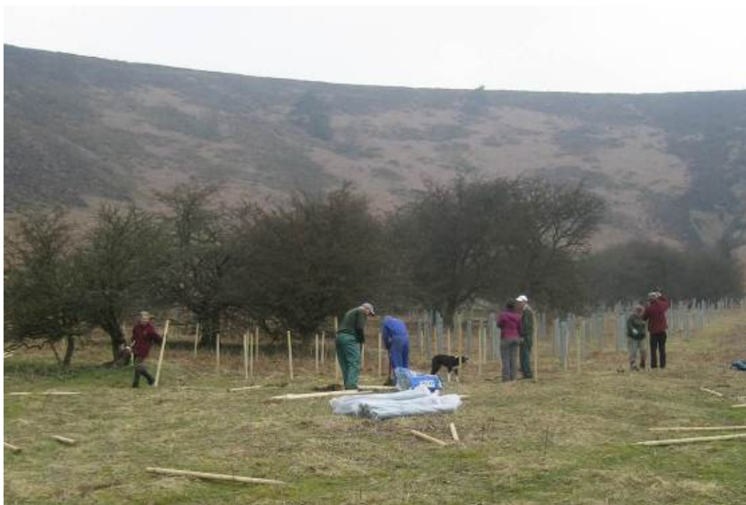
New planting of riparian woodland by volunteers in the Hole of Horcum in the Pickering Beck catchment