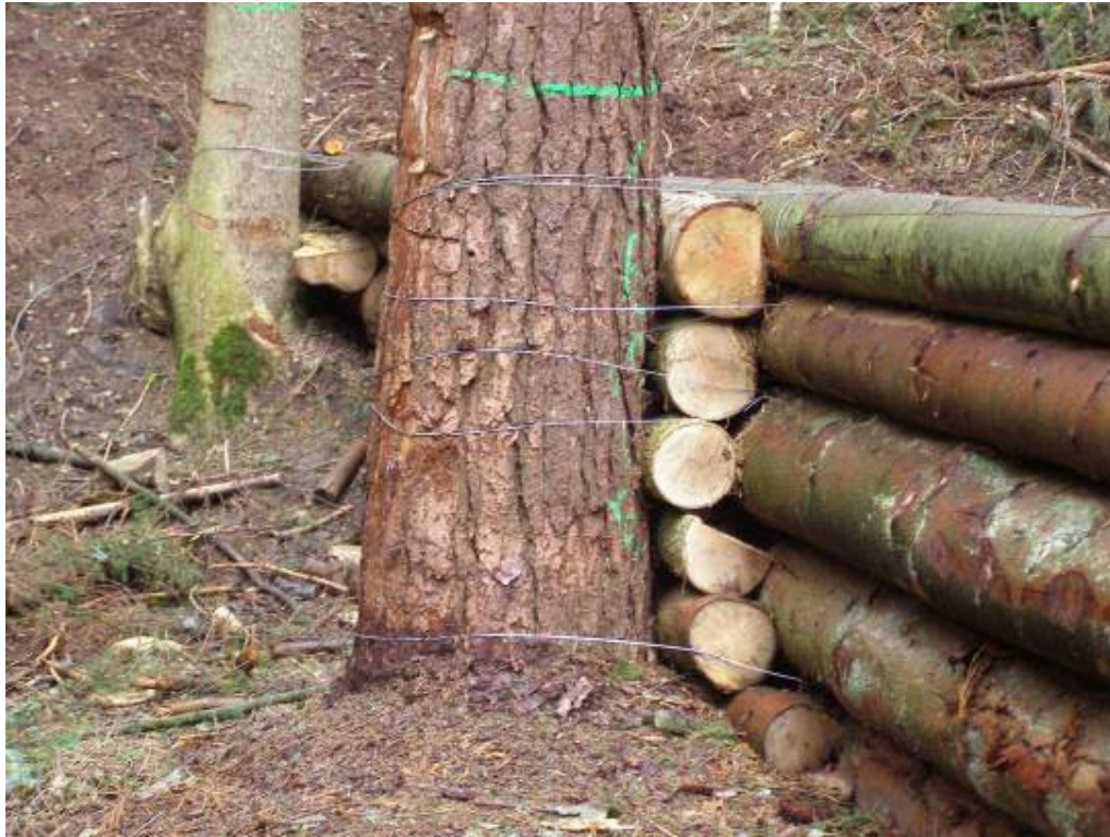
Use of wire to secure timber bund to long tree stumps