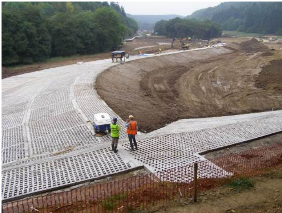
Main flood storage bund under construction in September 2014