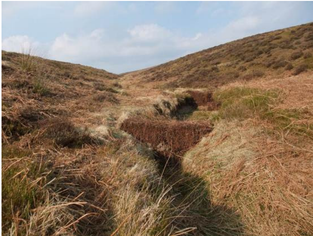
Use of heather bale check dams within moorland drains