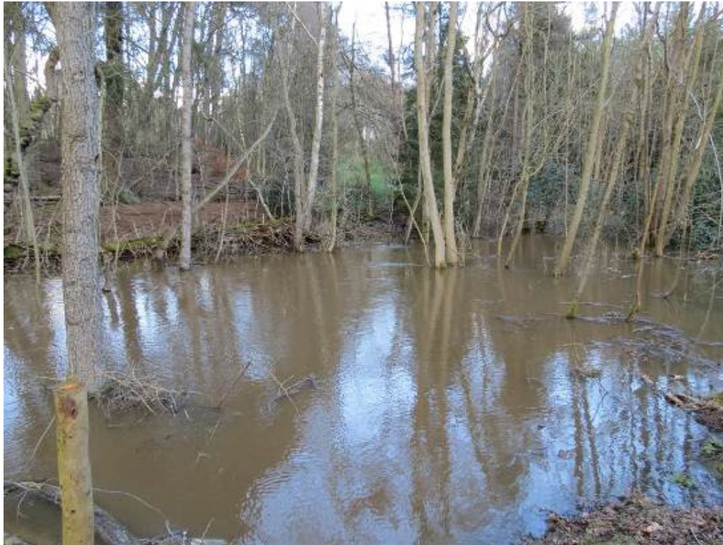
Backing-up of water upstream of LWD dam during flood