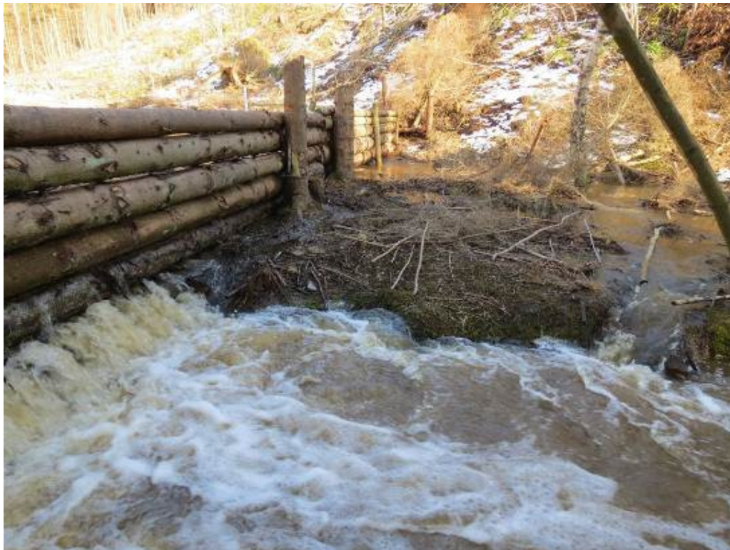
Timber bund during high flows