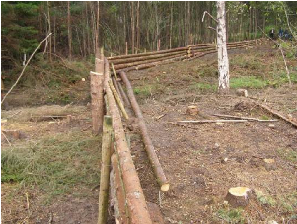
Downstream timber bund on Sutherland Beck