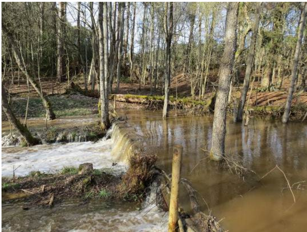
LWD dam during flood