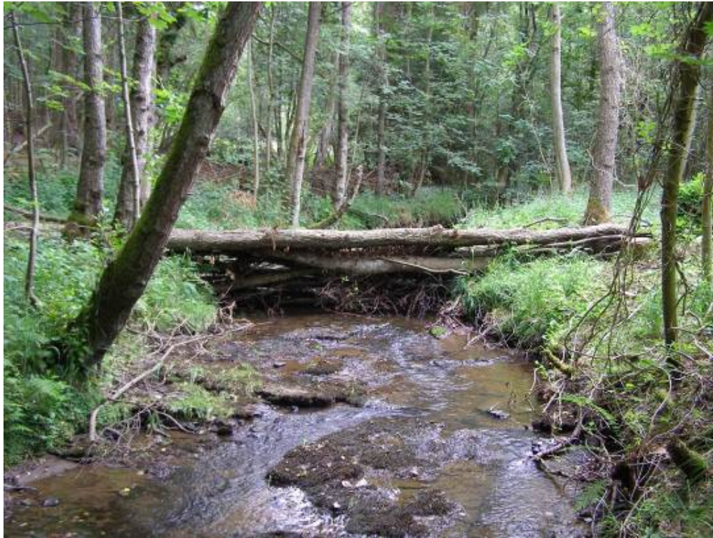
LWD dam using a cross log design on Sutherland Beck