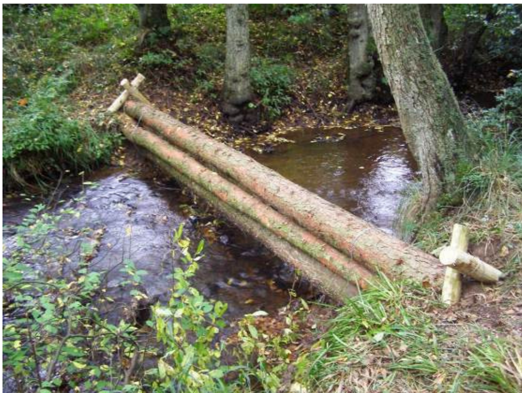
Large Woody Debris (LWD) dam secured by angled posts and wire on Pickering Beck