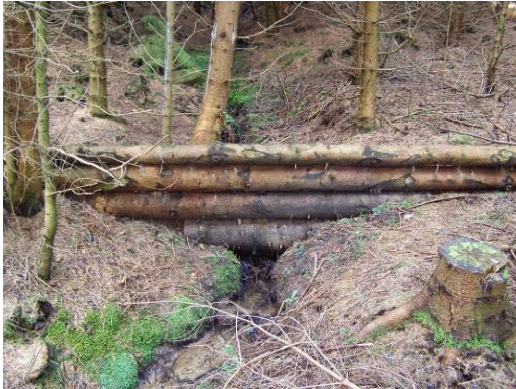
Smaller LWD dam on forest drain