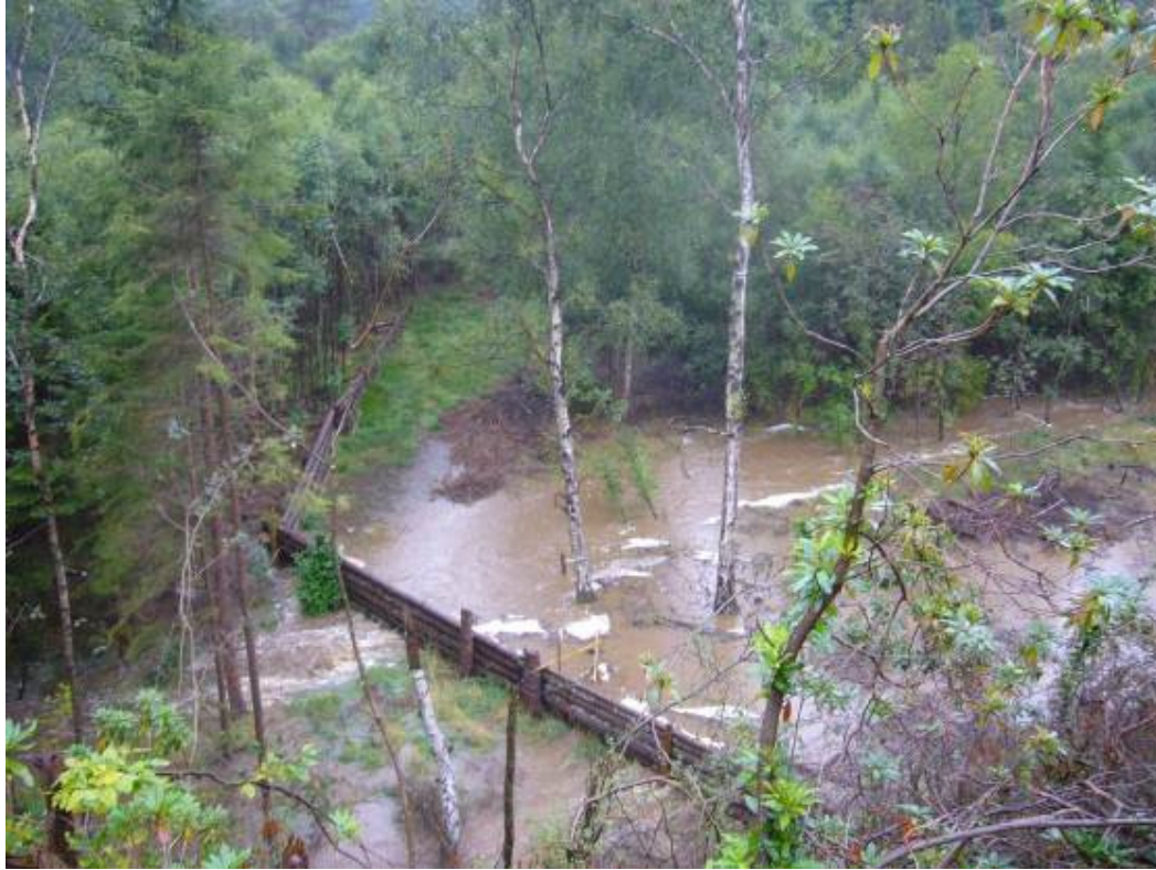
Downstream timber bund during November 2012 flood event (out-of-bank flow but water level only at first log in bund)