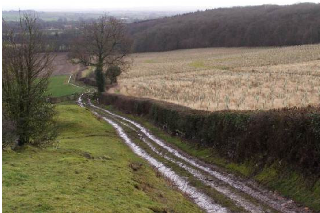
New planting of farm woodland in 2011 on sensitive soils in River Seven catchment