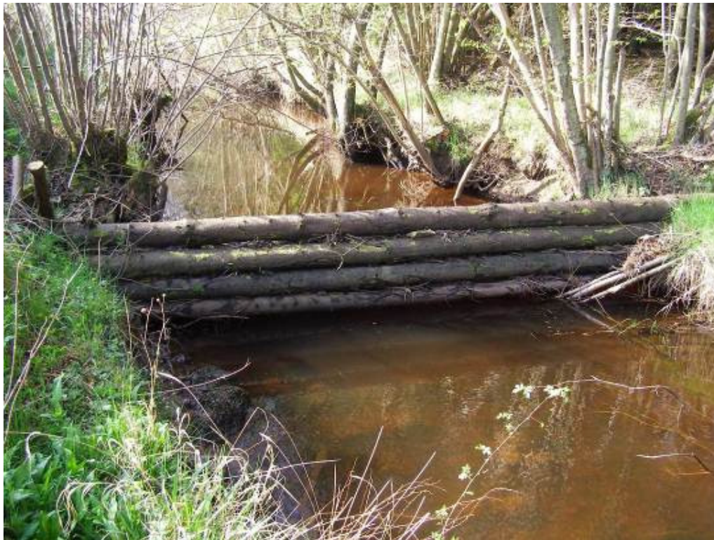
LWD dam using stacked logs secured by posts, wire and bracing on Pickering Beck