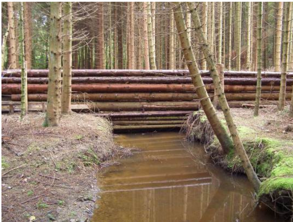
Face of upstream timber bund