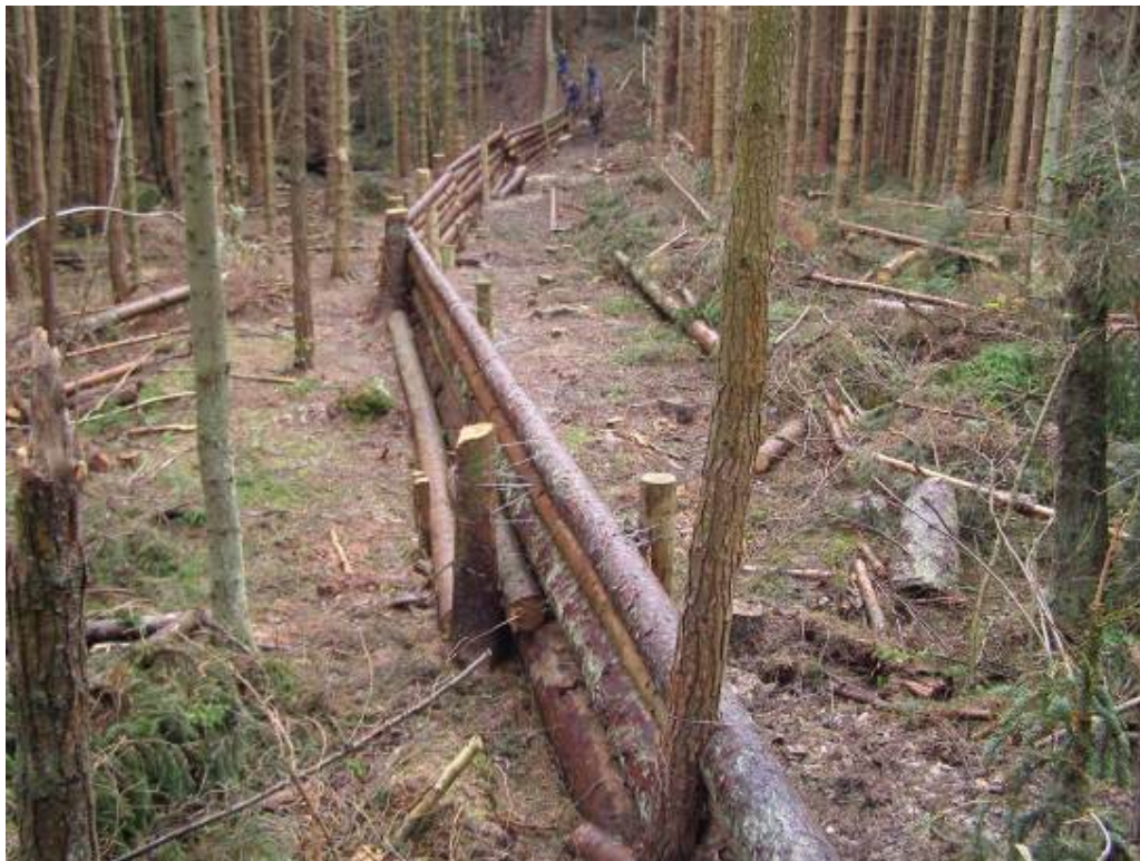
Upstream timber bund on Sutherland Beck