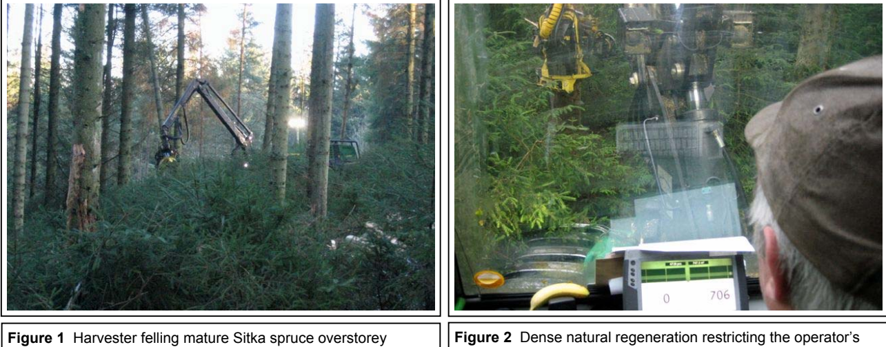
amongst dense natural regeneration

In Continuous Cover Forestry (CCF) the presence of dense natural regeneration can reduce visibility during harvesting (Figures 1 and 2). Many of the elements in a harvester work cycle depend on good unobstructed vision of the work area and reduced visibility is therefore a potential limiting factor on speed and safety. This IPIN identifies harvesting methods and technological improvements for harvesting in stands with limited visibility due to the presence of natural regeneration.