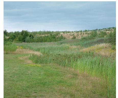
Figure 1 Restored sites often require cultivation prior to vegetation establishment.