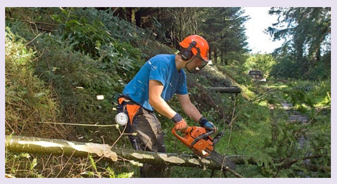
Chain saw training and experience opens up job opportunities. The safe use of power tools is part of the Dartmoor O&N Scheme

In July 2004, HMP Dartmoor secured Home Office approval to provide a stage 2 Resettlement Programme. Along with more personal freedom inside the prison, stage 2 offers the opportunity for participants to earn a regular wage for work undertaken. Money earned is then retained in a dedicated account for the prisoner, administered by HMP Dartmoor and only available to them on release; this helps them break out of the vicious cycle of 'no job', 'nowhere to live' and 'no money'.