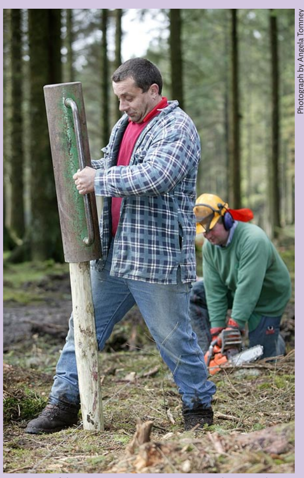
Being part of the team - Dartmoor Stage 2 Resettlement Scheme

The Forestry Commission (FC) has received several awards, and national recognition, for delivering cost-effective schemes that help ex-offenders secure full-time employment in the land-based sector. These practical schemes are changing lives and help offenders gain industry-relevant skills, work experience and the confidence to secure employment on release. They also bring real benefits for the community and the environment. With core funding, these schemes could operate across the UK and make a significant contribution to reducing re-offending rates.