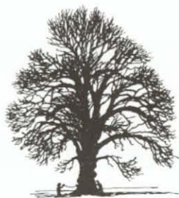
Figure 2: Outline of a typical mature black poplar.

This subspecies, which occurs in central Europe and extends eastwards, is not well known in Britain, so it is difficult, until more taxonomic research has been undertaken, to state precise diagnostic characters that distinguish it from subsp. betulifolia . Black poplar trees are most easily recognised from a distance, especially in winter. They have rough stems, often leaning at an angle, and dark grey rugged bark usually interrupted by large woody swellings or burrs. The arching lower branches are irregular and untidy (see Figure 2). The upper