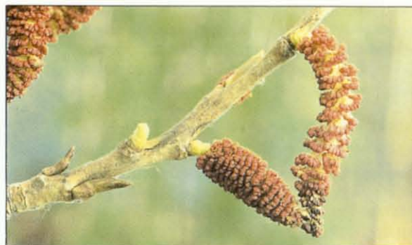
Figure 4: Female flowers, left; male flowers, right.