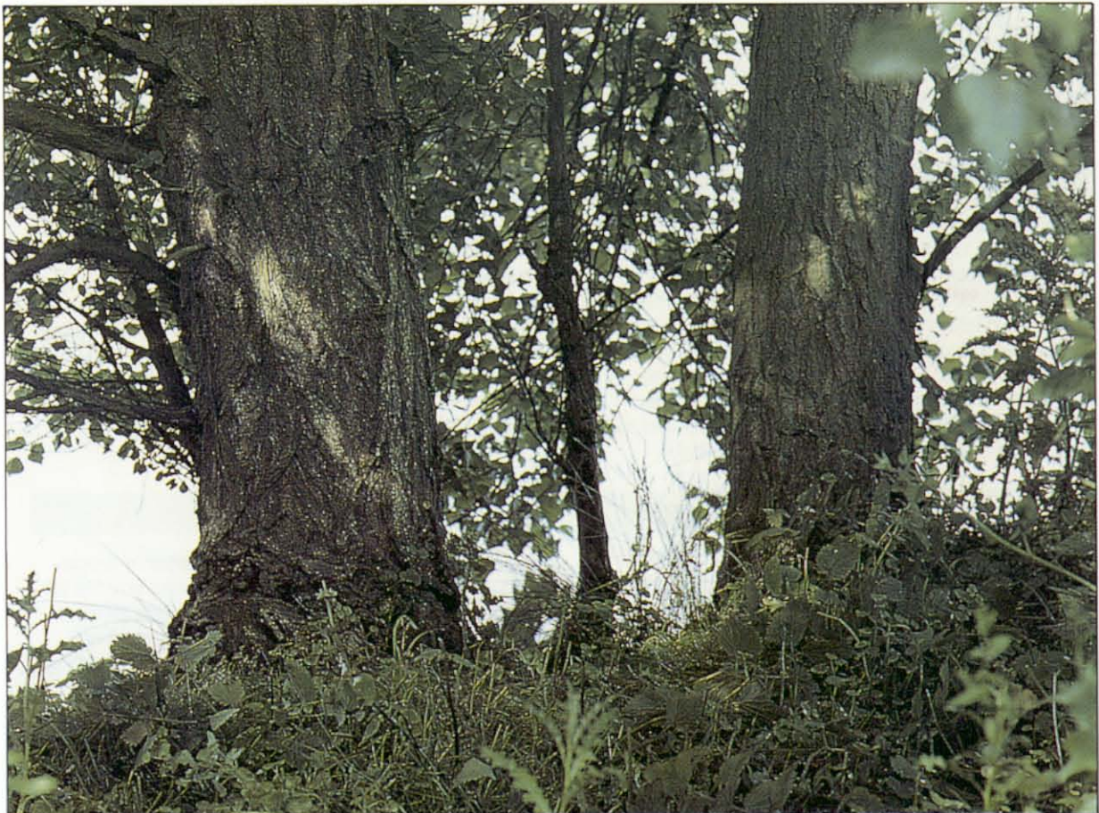
Figure 1: A rare occurrence of male (left) and female (right) trees side by side.

New conservation interest, sparked off by Edgar Milne-Redhead and his band of enthusiasts, has resulted in widespread new planting of vegetatively propagated trees and a few carefully selected seedlings, and this work appears likely to continue. Resistance in this subspecies of P. nigra to bacterial canker ( Xanthomonas populi ) also makes it an important genetic resource for scientists working on tree breeding.