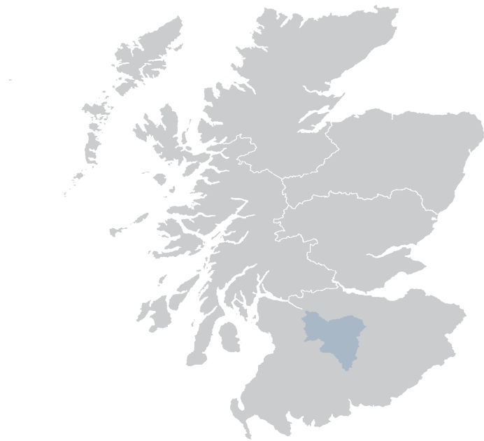
Map 1 South Lanarkshire

© Crown copyright and database right [2014]. All rights reserved. Ordnance Survey Licence number [100021242]