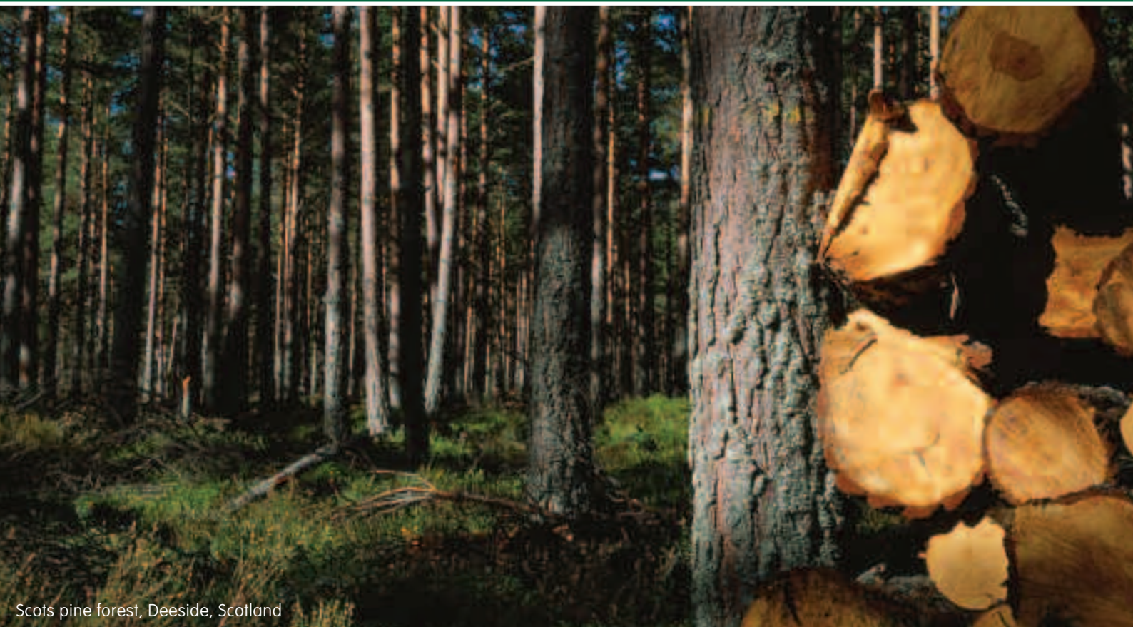
Scots pine forest, Deeside, Scotland