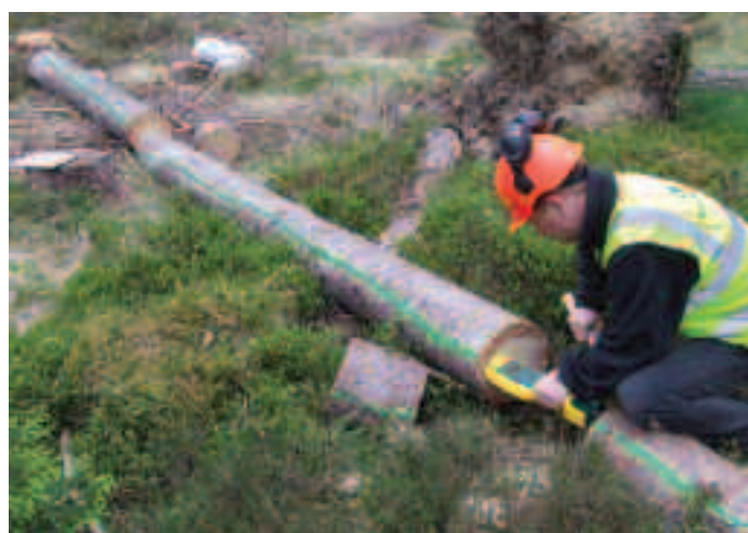
Figure 3 Testing Scots pine logs with the log acoustic tool.

Falling boards were appearance graded following the G4 method in EN 1611-1:2000 (CEN, 2000), which applies to softwoods for non-structural applications (e.g. cladding, joinery and furniture). Each falling board was assigned a grade from G4-0 (the highest quality) through to G4-4 (the lowest quality) based on an assessment of all four faces.