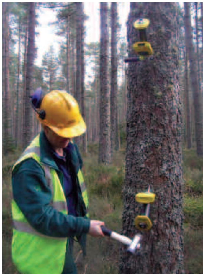
Figure 2 Assessing Scots pine with a standing tree acoustic tool.

Three trees were selected from each sample plot at random from those trees with a DBH of 28 cm or greater. For each selected tree the following branching characteristics were visually estimated: