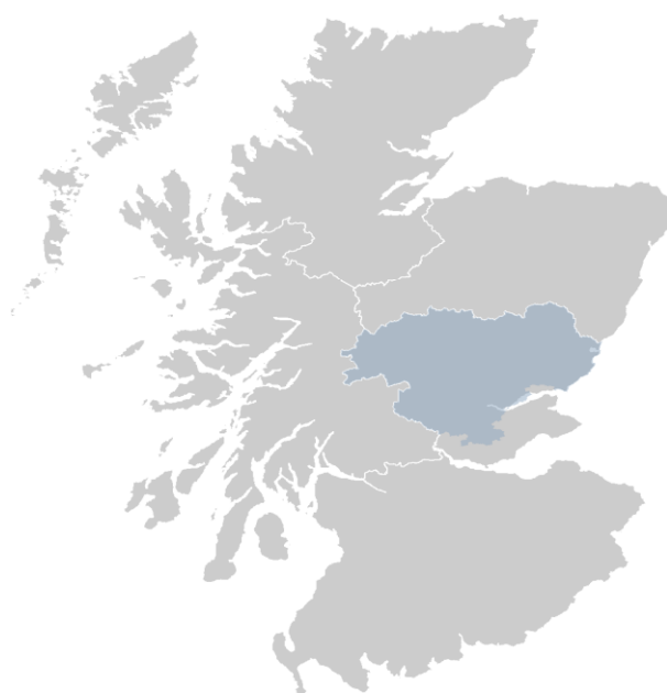
Map 1 Angus, Perth and Kinross