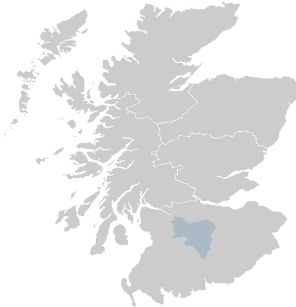
Map 1 South Lanarkshire

© Crown copyright and database right (2014). All rights reserved. Ordnance Survey Licence number 100021242