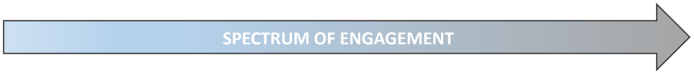
Figure 2: Spectrum of woodland engagement activities